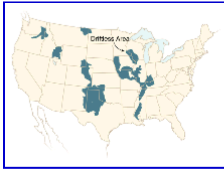
Fig. 1. Areas of cropland erosion. Areas of the United States having cropland erosion rates of >25 tons \text{ha}^{-1} year ^{-1} as predicted by the U.S. Department of Agriculture in 1982 [modified from (13)]. "Driftless Area" is approximately coincidental with Major Land Resource Area 105, Northern Mississippi Valley Loess Hills.

Indeed, measures of alluvial sediment flux are usually better measures of basin processes than are estimates of upland erosion or measurements of sediment yield (28, 29). During recent decades, when soil erosion rates were ostensibly so high, rates of alluviation declined in various regions (21, 27, 30). Studies of wind erosion mass budgets have been few, but these too show declining airborne dust (31). Thus, although mass budget studies of sediment and dust have been limited, much of the available field evidence suggests declines of soil erosion, some very precipitous, during the past six decades.