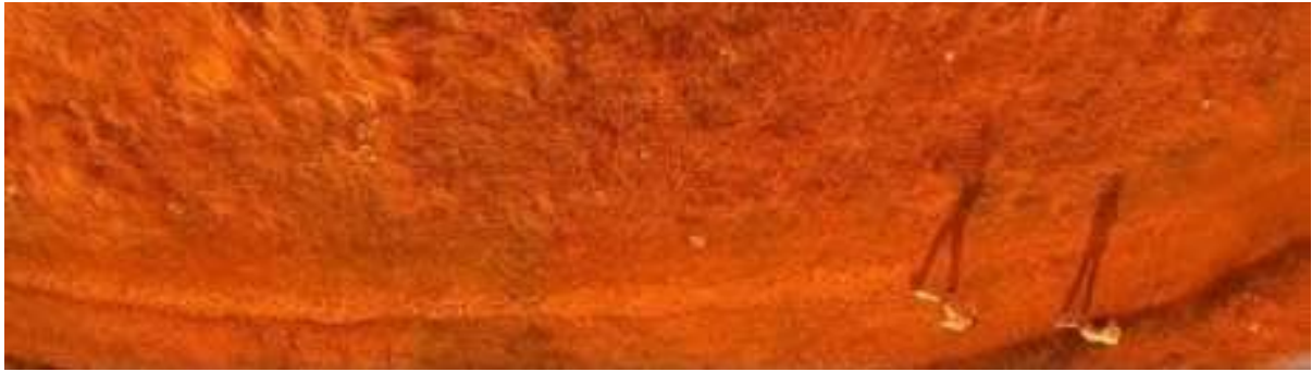
A photo of the researchers taken by the drone.