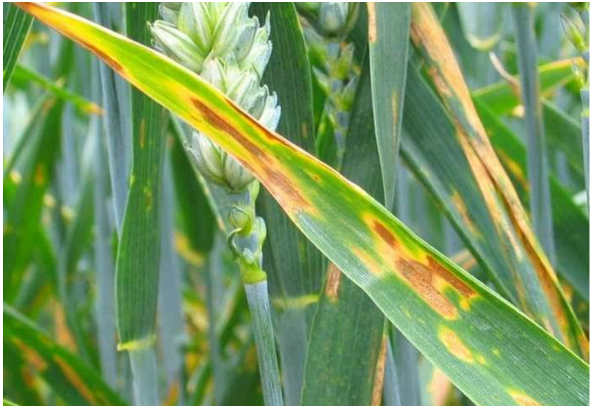
Septoria wheat fungus.

Researchers are developing drones that could detect plant disease before any visible signs show, allowing farmers to stop infections in their tracks.