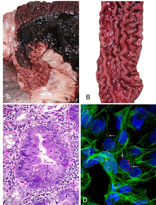
Figure 1. Lawsonia intracellularis infection and associated lesions. A. Pig ileum from a case of acute proliferative enteropathy (PE). The lumen is filled with clotted blood, and the exposed mucosa is markedly thickened and corrugated. B. Pig ileum from a case of acute PE. The blood clot has been removed to expose the highly corrugated mucosa. A severe case of chronic PE would appear similar grossly, lacking only the intraluminal blood clot. C. Dramatic enterocyte hyperplasia in an intestinal crypt from a case of PE, in which there is also goblet cell depletion. H&E. 400 \times . D. PK15 cells infected with L. intracellularis , which is labeled with a specific monoclonal antibody and detected with AlexaFluor594 (red; arrows). PK15 actin is labeled with phalloidin-495 (green), and nuclei are labeled with DAPI (blue). Immunofluorescence with confocal microscopy. 400 \times .

postmortem. 36 Diagnosis may also be hampered if PE is masked or complicated by other diseases, such as salmonellosis or swine dysentery. 78,100