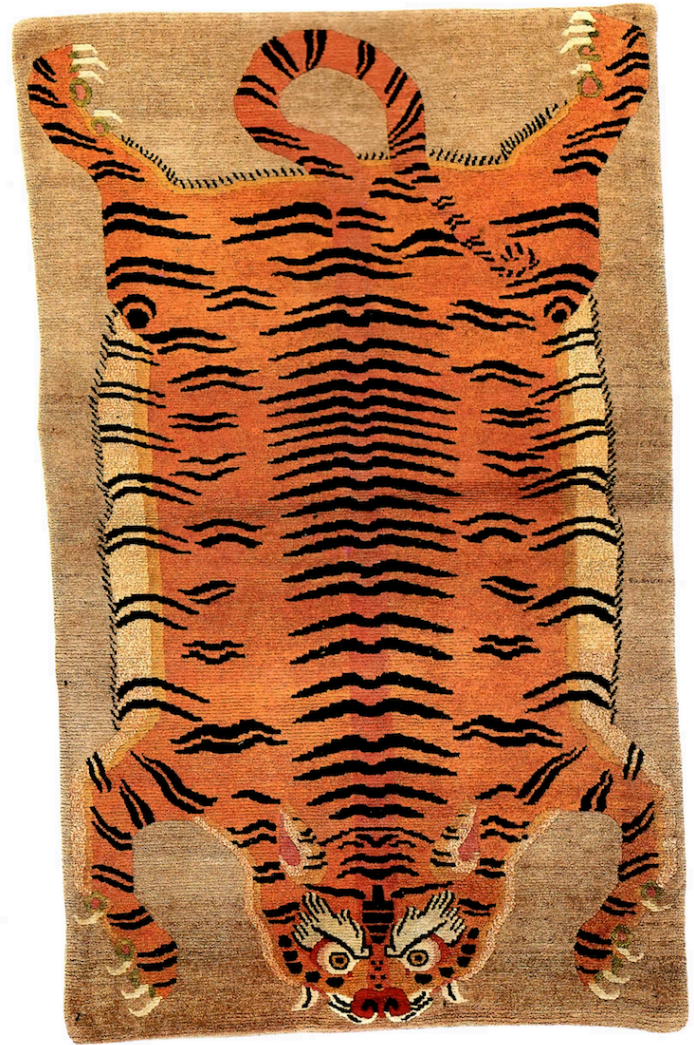
"A naturalistic tiger skin on a 4'11" x 3'1"

In the nineteenth century, the British Empire in India facilitated for the first time sales of Tibetan rugs to European consumers. However, the number of carpets that found their way out of Tibet was small. In 1959, the occupation of Tibet by the People's Republic of China prompted the Dalai Lama and approximately 100,000 other Tibetans to flee their country. Among the group were many of the Tibetan weavers. Most settled in Nepal, although a minority settled in the provinces of Dharamsala, Ladakh, or Sikkim in India.