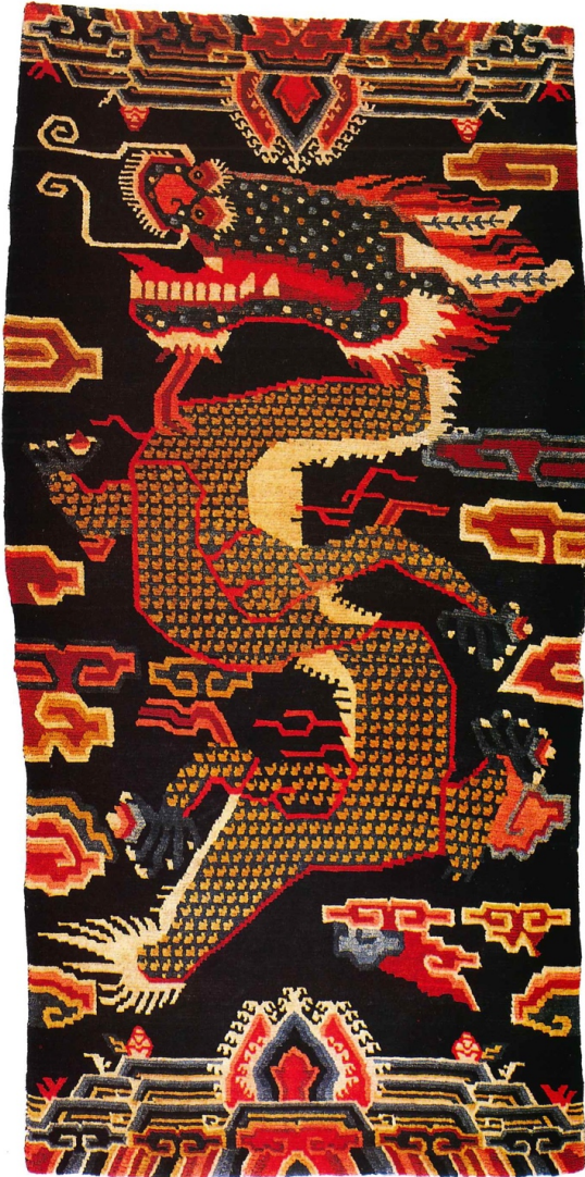
"Pillar-style Sleeping Rug," 3'0" x 6'4" a natural ground", (19th/20th century)