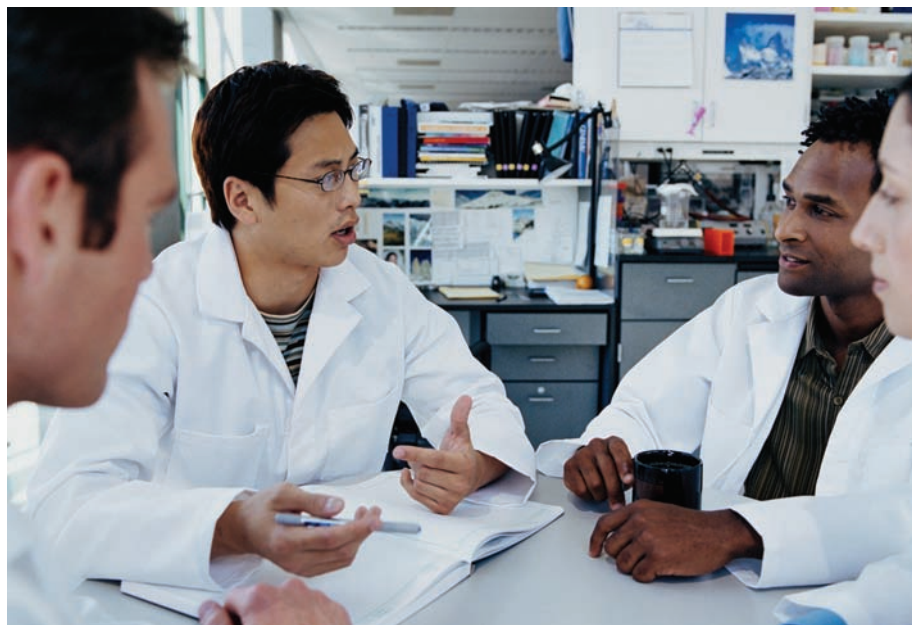
Fig. 2. Scientists routinely debate their theories, their data, and the implications. Research shows that argumentation in the classroom can improve conceptual learning.

In addition, notions of what constitutes scientific reasoning differ somewhat. Much of the research on individual's capability with scientific reasoning is a product of laboratory-based,