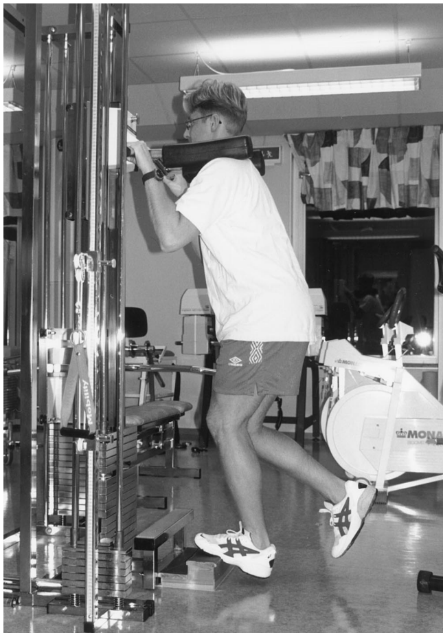
Figure 3. Increasing the load by adding weight with a weight machine.

between the different testing periods for the injured side. A P value of less than 0.05 was considered significant.