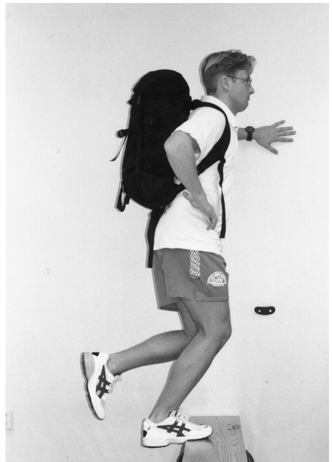
Figure 2. Increasing the load by adding weight in a backpack.

The Wilcoxon signed rank test was used to evaluate differences between the injured and noninjured sides and