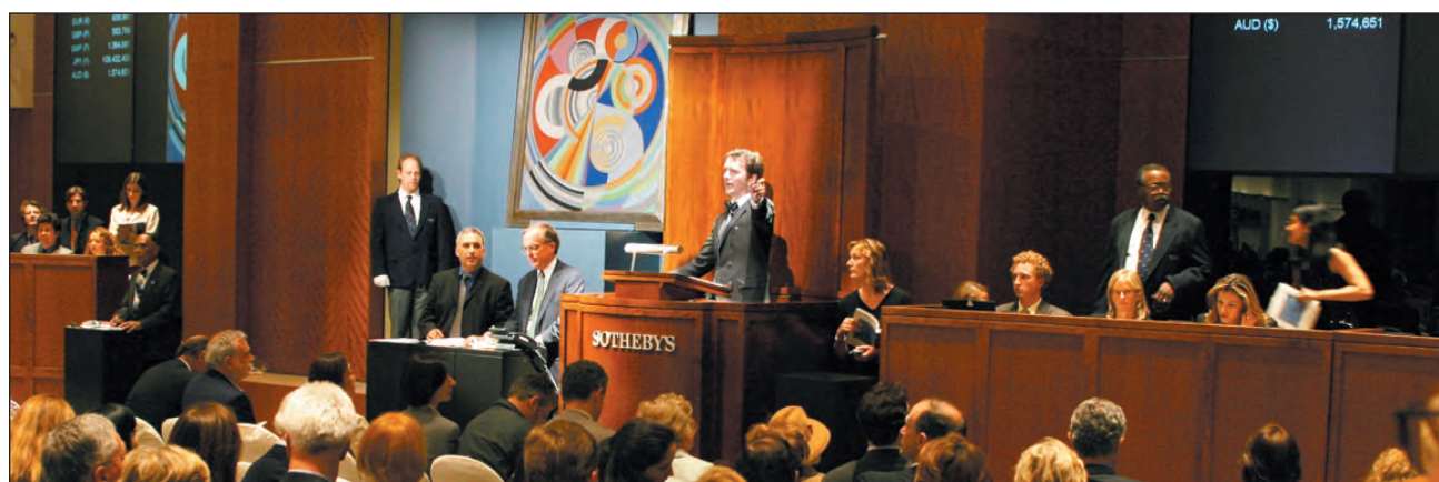
An auction in progress at Sotheby's auction house. Rules for designing and conducting auctions are changing rapidly with the application of principles of game theory.

Designing the auction rules was a problem of great complexity. The FCC had divided the spectrum into thousands of licenses. Should it auction them all at once or one at a time? Should it use an open bidding format or collect sealed bids? Could it choose rules that would ensure that the licenses went to firms that would use them quickly and efficiently? Could it avoid loopholes firms could exploit, as well as prevent companies from colluding with each other to keep prices low?