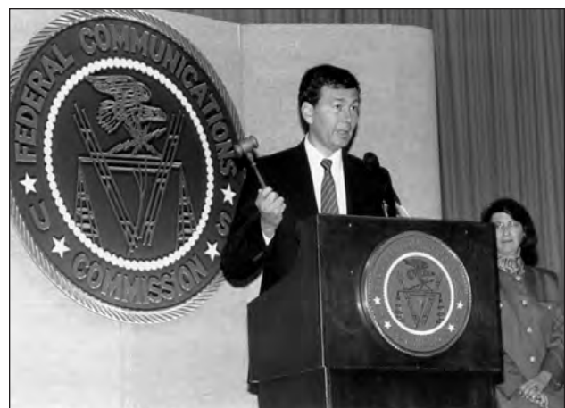
Reed Hunt, then FCC chairman, opening the spectrum auction in July 1994 at the Omni Shoreham Hotel. This auction was designed using principles of game theory and was very successful at generating revenue and distributing spectrum licenses efficiently.

The FCC had more than 2,500 licenses to dispense. Traditionally, when many items are up for auction, auctioneers sell them one at a time. But spectrum licenses, unlike rare coins or paintings, are not independent of each other: One company might want a northern California license only if it can also get a southern California license, for instance. If the licenses were auctioned one at a time, with the northern California license coming up first, a company that wanted both wouldn't know how high to value the northern license, since it wouldn't know what its chances were of getting the southern license later. This would create the risk that some licenses would fail to be won by the bidders who needed them most. And because bidders would have such incomplete information about the value of the licenses, they would bid cautiously to avoid the winner's curse. On the advice of game theorists the FCC decided to auction the licenses in one fell swoop, in spite of the challenges of running such a complicated auction.