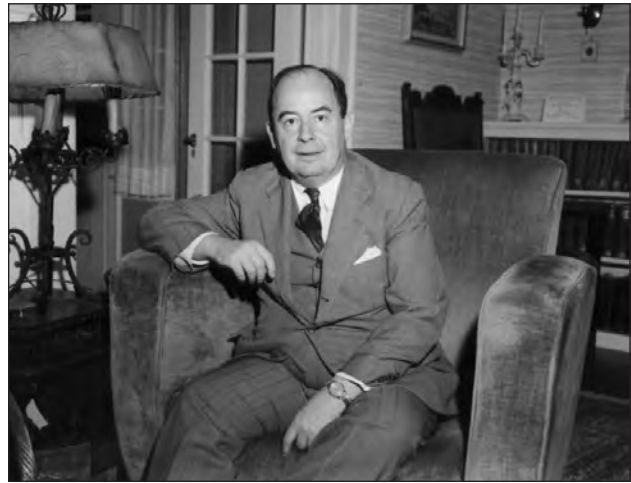
Renowned Hungarian mathematician John von Neumann launched the field of game theory in 1928.

The renowned Hungarian mathematician John von Neumann, a lecturer at the University of Berlin at the time, launched the field in 1928. He was curious about how game players should choose their strategies: When, for instance, should a poker player bluff? He studied two-player “zero-sum” games, such as chess and tic-tac-toe, in which the players’ interests are entirely at odds: in the simplest manifestation, one player’s gain is the other player’s loss. As any child knows, in tic-tac-toe both players can avoid losing; if they each follow their best strategies, they force the game to end in a draw. Von Neumann proved that in any two-player zero-sum game, not just in tic-tac-toe, there is a certain “right” outcome, in the sense that