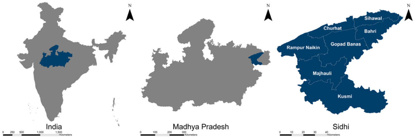
Figure 1. The figure shows the map of Sidhi district (right) where the assessment was undertaken, in the context of India (left) and the state of Madhya Pradesh (middle).