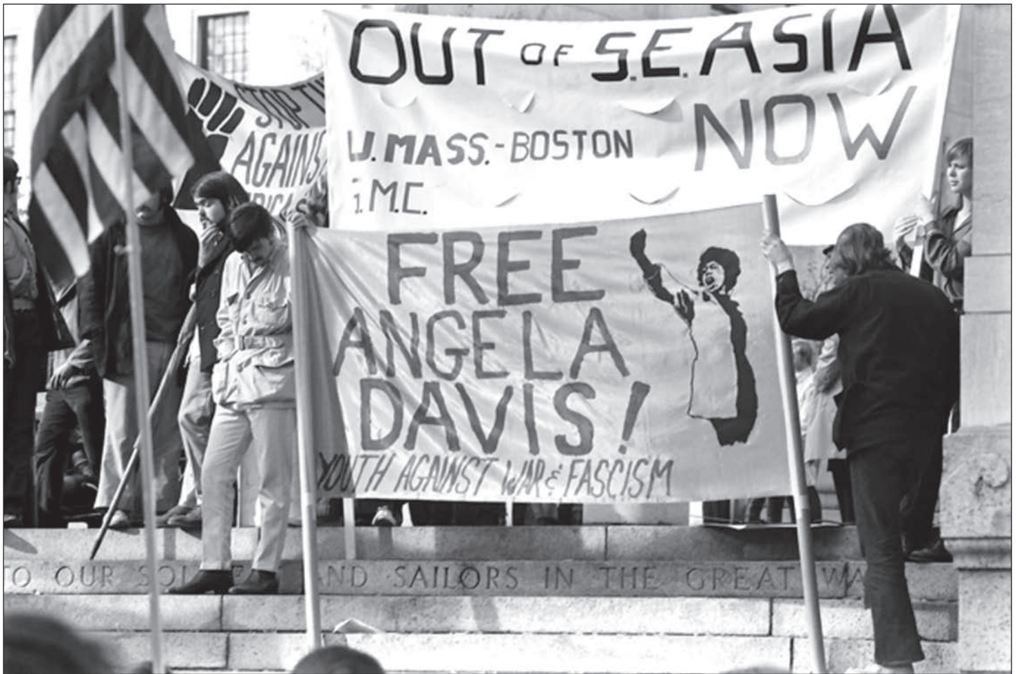
Protestors on Boston Common demanding an end to the Vietnam War and the release of Angela Davis, Boston, Massachusetts, 1970.

Carolina (2005), Greene argues that by the end of the 1960s “a new form of hypermasculinized Black Power politics had obscured the critical contributions of women to Black Power projects, particularly those undertaken at the local level” (26). In particular, Greene documents the internal gender and class conflicts of Durham’s Black Solidarity Committee, a local Black Power organization, which was led by black middle-class men, but empowered by mostly poor black women. According to Greene, without “poor women’s collective strength and perspective,” the boycott campaign of 1968-1969 would not have been as successful (27). In Up South: Civil Rights and Black Power in Philadelphia (2006), Countryman examines the gender politics of economic and community control, particularly “the contradiction between masculinist ideologies and the commitment of organizations . . . to the principles of community organizing and indigenous leadership development” (28). Countryman writes: