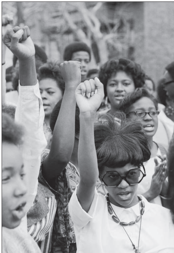
Young women raise their fists in the Black Power salute at a civil rights rally, ca. 1960s.

Within the last decade, numerous scholars have begun the important historical work of exploring black women’s engagement with black nationalism in the twentieth century and Black Power in the post-World War II United States (3). This essay discusses three foci guiding the scholarship: 1) black women’s relationships to nationally recognized Black Power organizations; 2) black women’s grassroots activism in cities during the Black Power era; and 3) black women’s radical responses to Black Power politics. This foundational scholarship highlights the varied battles and social protest traditions of black women during the Black Power era, as well as exposes a scholarly literature still in the making.