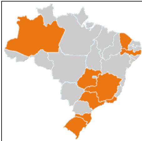
Figure 1. Map of Brazil with the nine states that took part in the Pilot Project (orange).

Medicine. To make this distinction, the term ‘teleconsulting’ is used to refer to where primary healthcare professionals use the BTP’s network to synchronously or asynchronously present questions to other health professionals and receive their responses (within 72h when asynchronous). Formative Second Opinion then utilises some of the clinical questions that arise frequently during these teleconsultations and, through a defined process, collates and summarises the questions and best evidence responses making them widely available (and searchable) on the network’s website. Both of these practices are considered learning or knowledge translation activities that share knowledge and professional experience. (Figure 2) During implementation, the monitoring and evaluation