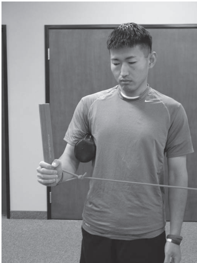
Figure 8 External rotation oscillation.

Finally, the use of isokinetic exercise, initially in the modified base position, which is characterised by the glenohumeral joint elevated 20–30° in the scapular plane position 95 96 and progressing to 90° abducted training, has been shown to increase multiple parameters of muscle function 113 114 and also to improve functional performance. Multiple sets of 15–20 repetitions are applied using the isokinetic dynamometer focusing on faster, more functional contractile velocities (speeds) and using load ranges similar to those used during functional activities. Plyometric exercises for the posterior rotator cuff in overhead athletes are also used in the later stages of rehabilitation in the 90/90 position (figure 10). Descriptive reports of electromyographic activity in the rotator cuff and scapular musculature have demonstrated favourable activation of these important muscles using 0.5 and 1 kg medicine balls, with improvements in both concentric and eccentric rotator cuff strength following an 8-week training