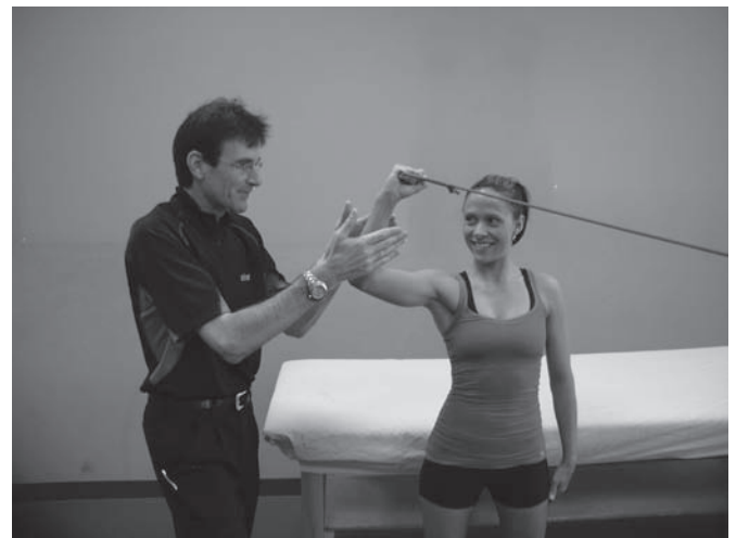
Figure 9 Perturbations applied to the patient's extremity in the 90/90 position using the scapular plane.