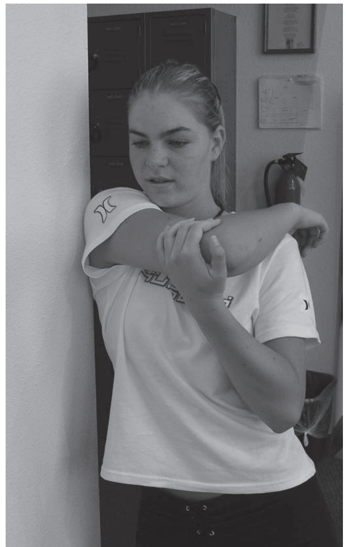
Figure 5 Cross arm stretch using the wall for additional scapular stabilisation to improve internal rotation range of motion.