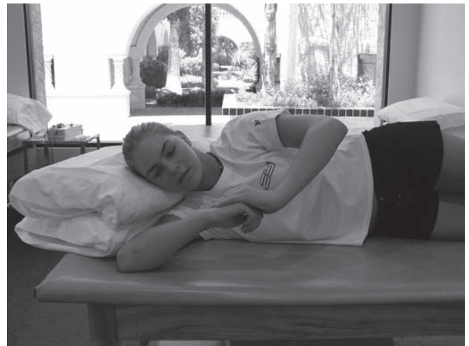
Figure 4 Sleeper stretch used as a home programme activity for patients with limited internal rotation range of motion.

Several authors have demonstrated altered muscle activity patterns in the scapular muscles in patients with shoulder impingement. These include decreased muscular activity or