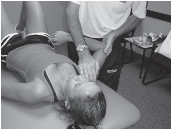
Figure 3 Figure 4 internal rotation stretch. Hand placements allow for containment of humeral translation and scapular compensation.

Several authors have demonstrated altered muscle activity patterns in the scapular muscles in patients with shoulder impingement. These include decreased muscular activity or