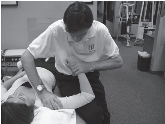
Figure 2 Internal rotation stretch using therapist’s leg as a stabilising platform to allow both hands to control glenohumeral internal rotation and utilise the scapular plane.

Scapular dyskinesis is generally characterised by a lack of upward rotation, a lack of posterior tilting and increased internal or medial rotation of the scapula. 38 39 41–44 These changes in scapular kinematics, in the resting position as well as during dynamic arm movements, have been attributed not only to altered recruitment patterns and muscle performance in the scapular stabilising muscles, 38 46–51 but also to flexibility deficits in the soft tissue surrounding the scapula, possibly restricting normal scapular movement during daily activity and sport-specific movements. 12 52–55