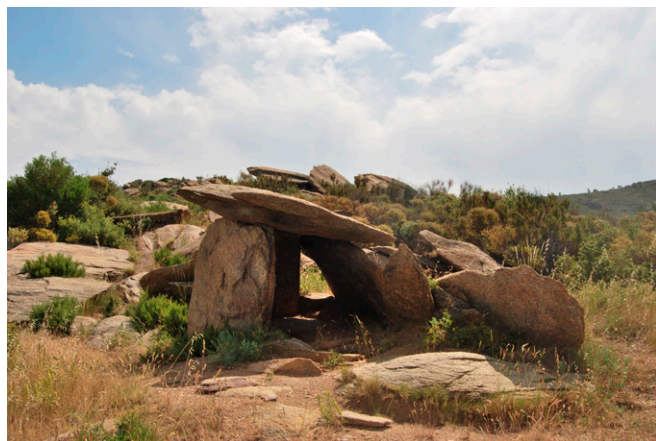
Fig. 1. Dolmen de las Ruines, Catalonia.

megalithic sequence as precisely as possible, we adopted a Bayesian modeling approach, which is applied here to a wide region, using the program OxCal 4.1 (11, 12). We combined measurements with archaeological information relating to stratigraphical contexts, associated cultural material, and information on the burial rites, to narrow the time intervals for the calibrated ranges. In a first important step, we reviewed critically the 2,410 samples, including measurements from the 1960s up to the present, to determine the quality and reliability of the sample contexts. For each site with available radiocarbon results and a suitable sequence, we constructed one-phased or multiphased models with phase boundaries ( Datasets S2 and S3 ) taking into consideration the detailed stratigraphic information (13). The posterior density estimates expressed as probability distributions in the text and in the figures are given by convention in italics to distinguish them clearly from simple calibrated radiocarbon dates.