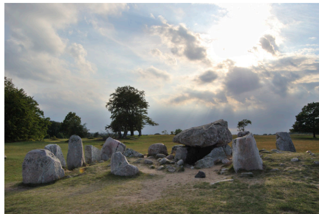
Fig. 2. Haväng dolmen, Scania. Strikingly, the architectonic concepts of megaliths are similar or even identical all over Europe.

In the northern half of the western Iberian Peninsula, there are early megaliths, concentrated mainly in Galicia. So far, these