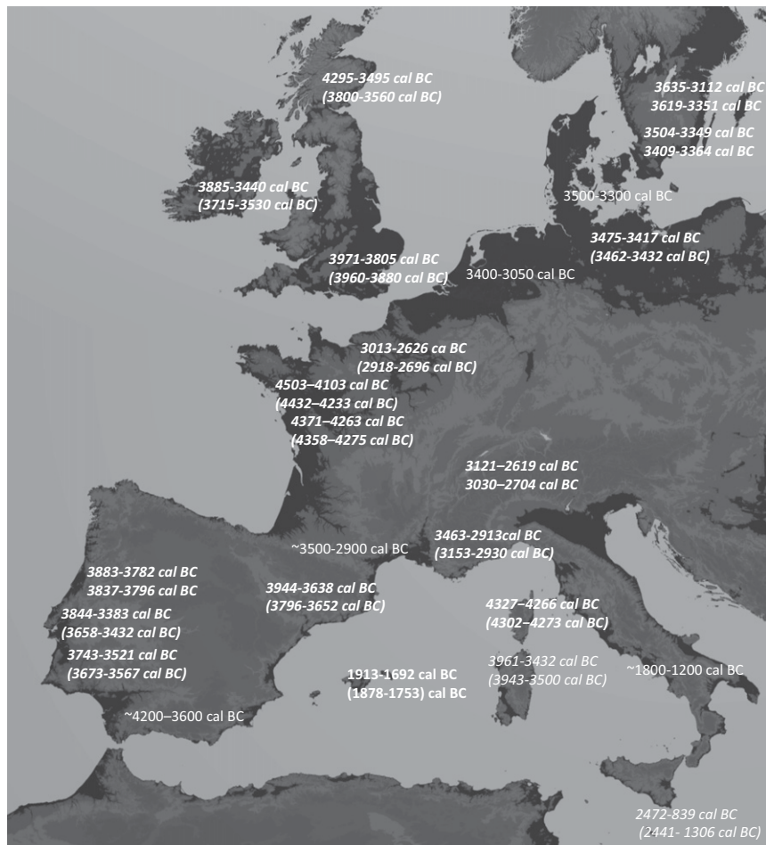
Fig. 4. Map showing dates estimated for the start of accessible megaliths as dolmens and passage graves in the different European regions, with 95% probability (68% probability in brackets). Italic bold type is used for date ranges of the posterior density estimates based on samples from accessible megalithic graves, regular bold type is used for simple calibrated radiocarbon dates from accessible megalithic graves, and regular italic type is used for the probabilities of the posterior density estimates associated with the earliest cultural material in dolmen or passage graves.

Balearic Islands, Apulia, and Sicily. These are associated with the Bronze Age and/or with the Bell Beaker phenomena (25).