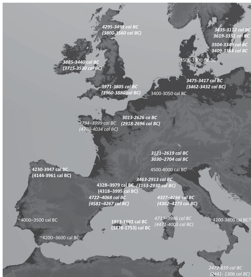
Fig. 3. Map showing dates estimated for the start of megaliths in the different European regions, with 95% probability (68% probability in brackets). Italic bold type is used for date ranges of the posterior density estimates based on samples from megalithic contexts, regular bold type is used for simple calibrated radiocarbon dates from megalithic contexts, and regular italic type is used for the probabilities of the posterior density estimates associated with the earliest cultural material in the megaliths.

have been dated to the very end of the fifth millennium cal BC, if not later. Most of these dates are from charcoal, and many represent termini post quos values due to the inbuilt age of the wood or unsure contexts. From Chan de Cruz 1, a possible construction or usage date from \sim 4080 cal BC (CSIC-642, 5210 \pm 50 BP, 4144 cal BC to 3961 cal BC, 68.2%; 4230 cal BC to 3947 cal BC, 95.4%) (Dataset S1, 2014) is available.