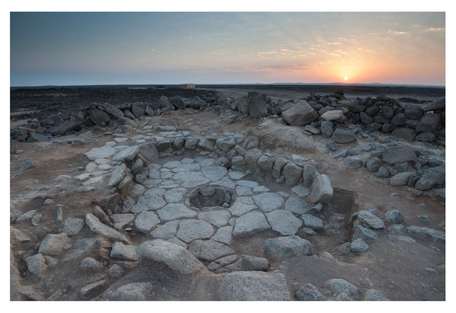
Fig. 2. The site of Shubayqa 1 showing Structure 1 and one of the fireplaces (the oldest one) where the bread-like remains were discovered.

At Shubayqa 1, a total of 24 food remains were categorized as bread-like products based on the estimation, quantification, measurement, and typological classification of plant particles and voids visible in the food matrix (Materials and Methods). From these, 22 were found in the oldest fireplace and 2 in the youngest. Macroscopically, all fragments showed a starchy, often vitrified, microstructure and irregular porous matrix, indicative of well-processed food components (Fig. 3A and SI Appendix, Figs. S1 and S8). The average size of the remains was between 4.4 mm width, 2.5 mm height, and 5.7 mm length (SI Appendix, Table S1). The basic classification system based on height measurements suggests that they probably represent unleavened flat bread-like products, as their height was <25 mm (13). This idea is supported by the size of the voids. In modern leavened breads, voids are >1 mm in size and commonly cover 40-70% of the matrix (14). The size of the voids of the bread-like remains from Shubayqa 1 was 0.15 mm on average and they were present in 16% of the matrix (SI Appendix, Table S2). These results are in agreement with finds identified as "flat breads" from several Neolithic and Roman age sites in Europe and Turkey (2, 11, 12).