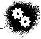
Table 3. Tentative (environmental) sustainability characteristics of different PSS types