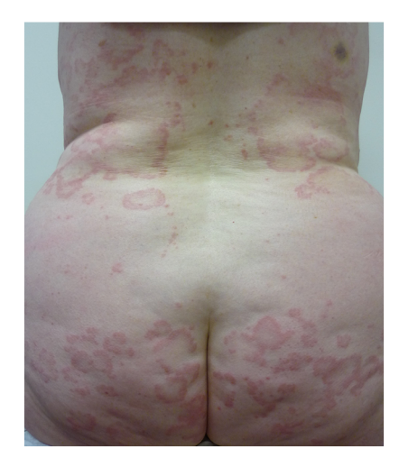
Figure 2 Bullous Pemphigoid may also appear as annular or urticarial plaques with central regression.