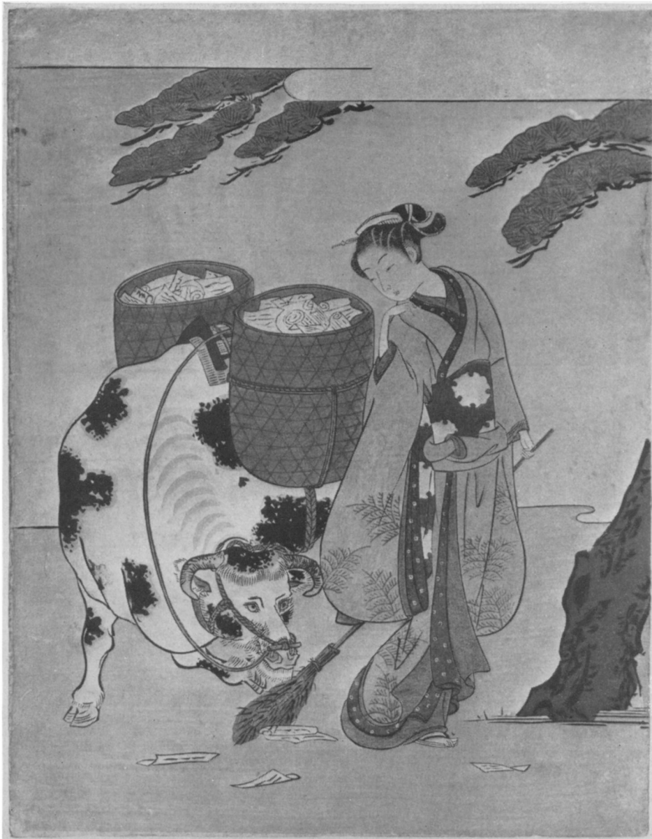
O-Sen sweeping up her love letters. By Suzuki Harunobu (1725-1770). O-Sen was a celebrated beauty of the Kagiya, a teahouse at Kasamori shrine. H. 11 \frac{1}{8} inches

The prints were made in the following way: The artist drew the design on thin paper, then the engraver pasted it face downward on a flat block of wood (usually cherry), scraped the paper away at the back until the design showed clearly, and cut away the wood in the areas that were not to be inked, leaving the design standing free. This block was printed in black, and the color was filled in by hand. When, eventu-