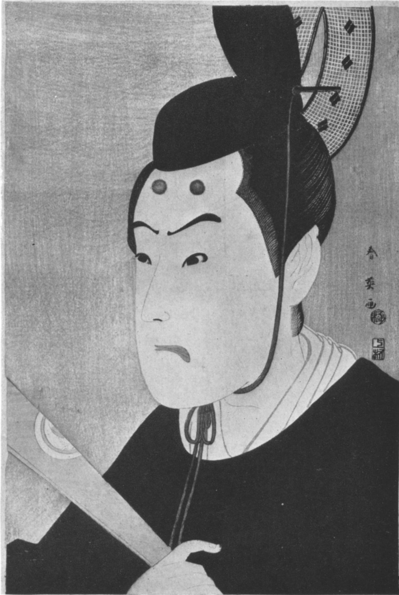
The actor Bando Hikosaburo III as he appeared in the drama "Sugawara no Michizane." By Katsukawa Shunyei (1768-1819). H. 15¼ inches

period of Japanese prints apply to the great poet landscapists of the nineteenth century.