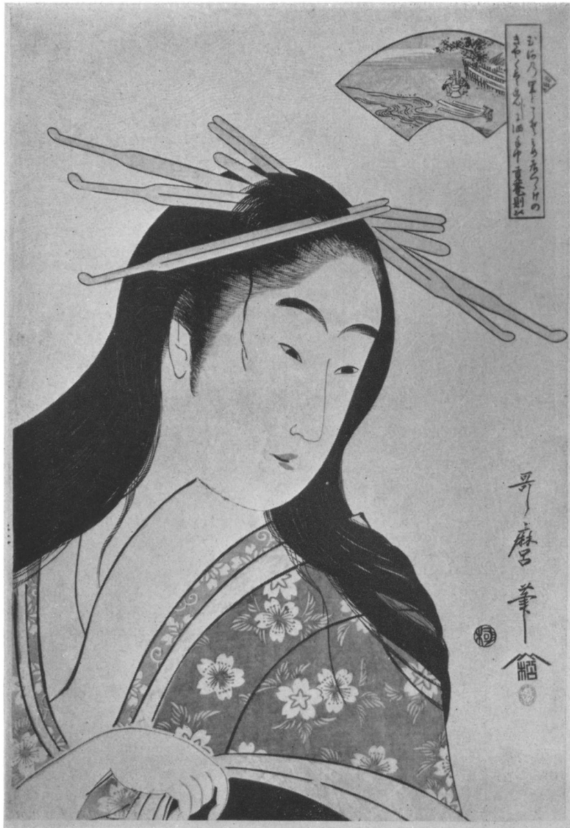
Portrait of a woman. From the Six Tama Rivers series, by Kitagawa Utamaro (1753-1806). A poem is illustrated at the right. H. 14½ inches