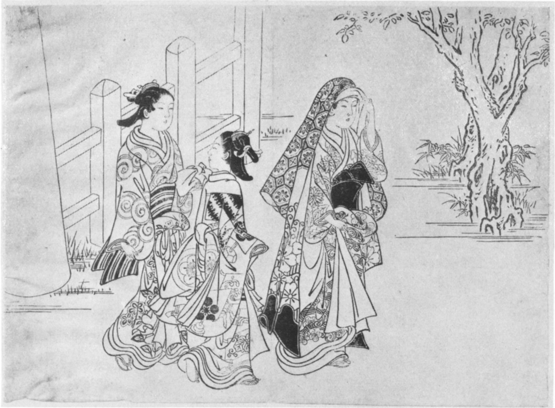
A courtesan, with two attendants. Book illustration in black and white, by Nishikawa Sukenobu (1671-1751). H. 10¼ inches. The prints reproduced in this article are in the Phillips collection.

“Pictures of the Floating World,” “Pictures of the Passing Scene.” Thanks to them, we of the present day can see the changing pageant of the years in Tokyo. We can watch the long procession of beautiful women, observe their delicious eccentricities in dress and hair arrangement, and be dumbfounded, as we are here in the present day, by the changing ideal not only in hair arrangement and dress but in actual physical conformation. It is bewildering. Perhaps Stella Benson’s observation that “men are akin to sheep as well as to monkeys, and the theory needs only a Darwin to trace the connection” applies to women too; though she goes on to say: “I have yet to meet the man who, where women are concerned, does not follow in the track of others of his kind. I think that very few men conceive an original preference for a woman unbiassed by the public tendency” ( I Pose , London, Macmillan and Co., Limited, 1930, p. 122).