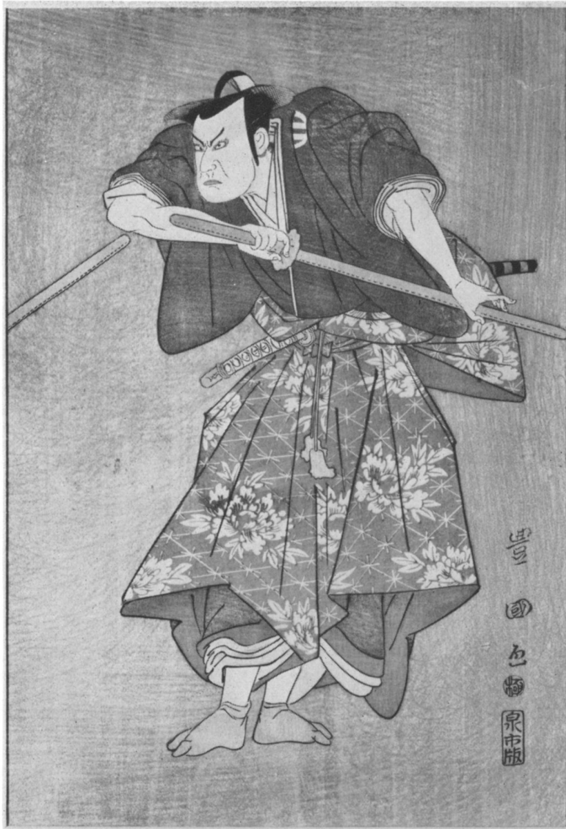
The actor Kataoka Nizayemon in ceremonial robes. The right-hand leaf of a diptych, by Utagawa Toyokuni (1769-1825). H. 14 1 / 16 inches

Moon at Kanazawa; and others. The Hokusai group includes complete sets of the Waterfalls and the rare Ryukyu Island series, all of the forty-six views of Mount Fuji known as the Thirty-six Views of Mount Fuji, eleven of the Famous Bridges, and many of the Hundred Poems Explained by the Nurse. The quality of the collection is excellent throughout.