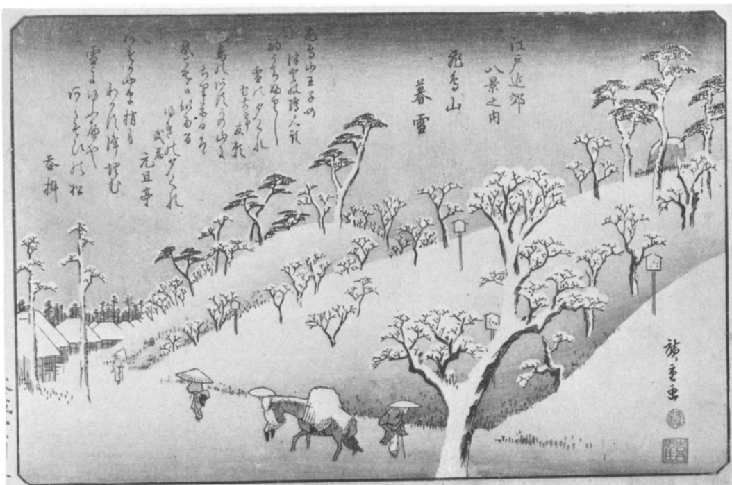
ABOVE: The lone fisherman . From the series Thirty-six Views of Mount Fuji , by Katsushika Hokusai (1760-1849). BELOW: Asukayama in the snow at evening . From the series Eight Views of the Environs of Yedo , by Utagawa Hiroshige (1797-1858). H. 10¼ and 9¼ inches