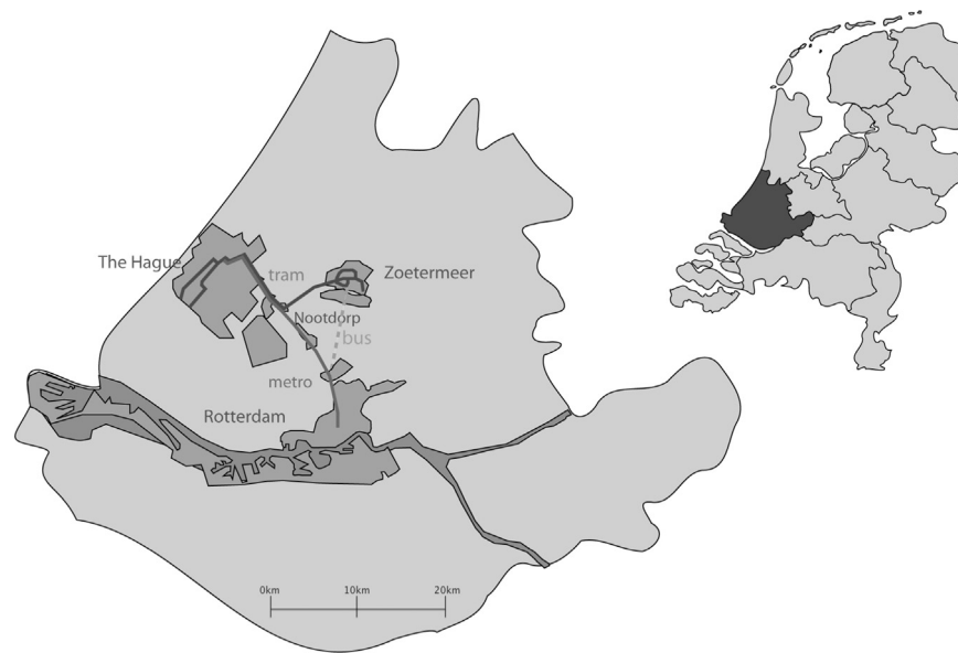
Fig. 3. RandstadRail project.

becomes very difficult to stop that idea.” The HSL, from concept to definitive design, spreads over decades with different politicians, coalitions and actors. Yet the basic preferred route remained the same. The tunnel solution was the culmination of the reactive resilience of the preferred route. As it seemed the support for the Bos route was becoming a majority in the parliament with even two of the three parties in the government coalition backing the alternative, Prime Minister Kok had to step up and wield his power to push the preferred route through (Haan, 2004). He had to pressure his own minister of spatial planning and find the additional 900 million guilders (about €400 million) for the tunnel under the Green Heart in order to please this minister as well as the Liberal (VVD) minister of transport who favored the preferred route.