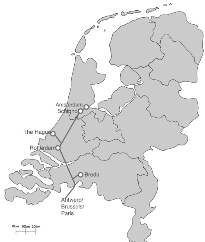
Fig. 1. Route HSL-Zuid (Giezen, 2013).

In 1977, the HSL first entered the public domain with the AmRoBel report (Ministerie van Verkeer en Waterstaat, 1977). For about a decade it remained on the agenda through PCBA, a working group consisting of the Ministry of Transport, Public Works, and Water Management, and the railways. The group continued to explore possible high-speed connections between