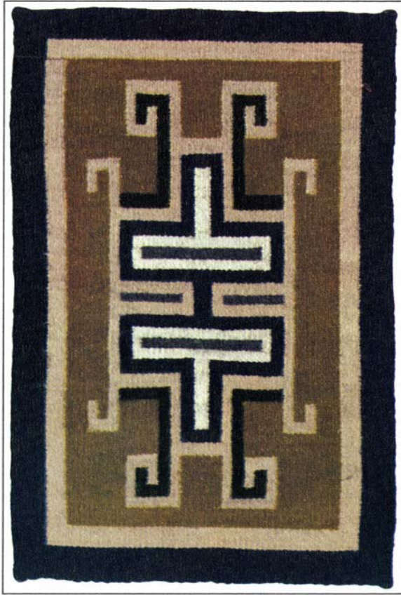
Figure 1. Shiprock Dedication Commemorative Brochure , September 6, [1969], lot X5184.2009, folder 102725169, Computer History Museum, Mountain View, CA.

a short paragraph: “Thank you for helping us celebrate the dedication of Fairchild Semiconductor’s new Shiprock facility—a partnership in progress.” 27