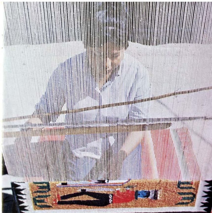
Figure 2. Shiprock Dedication Commemorative Brochure , September 6, [1969], lot X5184.2009, folder 102725169, Computer History Museum, Mountain View, CA.

shoulder, supervising and admiring her work (fig. 3). The text negotiates the transition from traditional artisanal cultural work to industrial wage labor by asserting that “building electronic