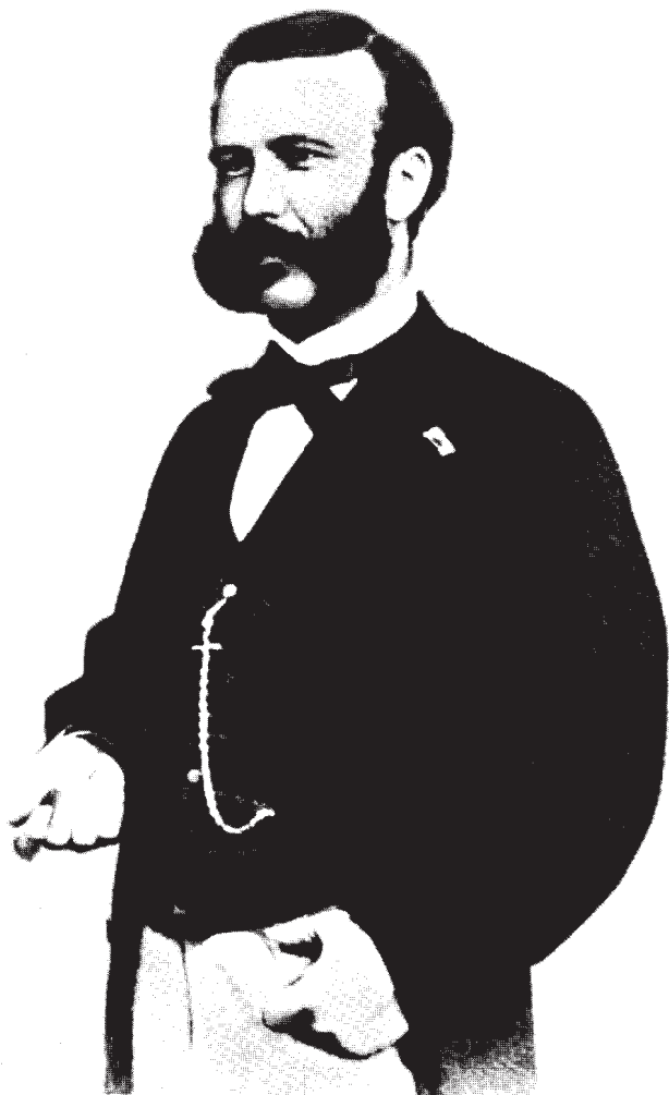
J.-Henry Dunant (1828-1910)