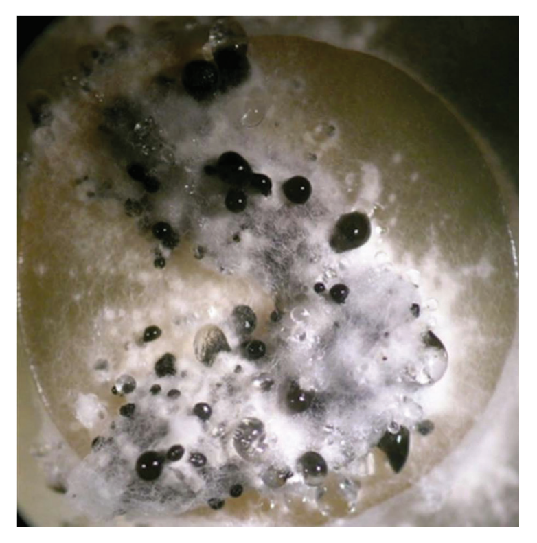
Figure 9. Sclerotium of Sclerotinia sclerotiorum colonized by Coniothyrium minitans.

Biological control products will not eliminate all sclerotia; fields heavily infested with sclerotia may continue to have disease development until the number of sclerotia in the soil is further reduced. More studies are needed to evaluate the efficacy of biological control products and their potential to reduce white mold of soybean, especially in fields with native populations of biological control fungi.