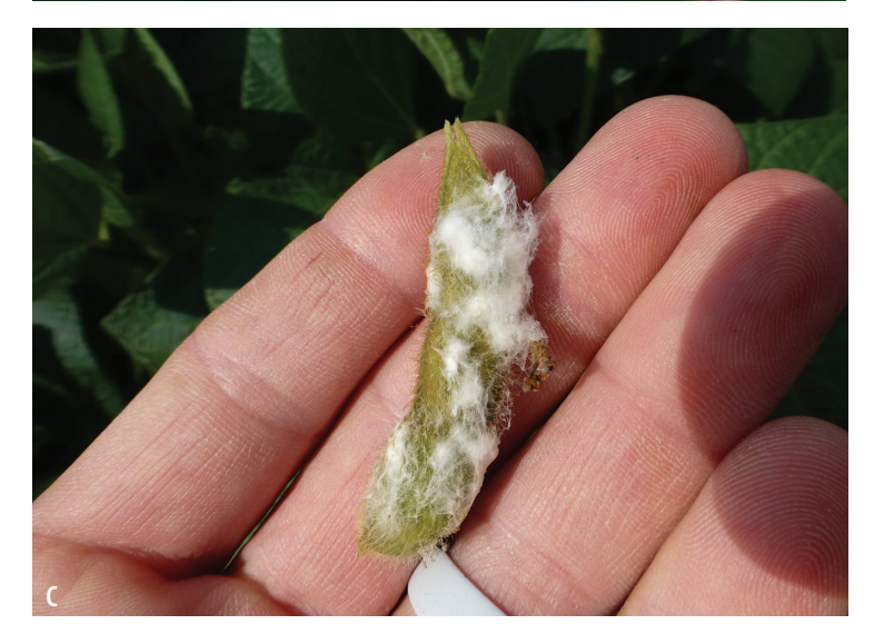
Figure 4. (A) Signs of Sclerotinia sclerotiorum include white tufts of mycelia and sclerotia produced inside and outside stem tissue. (B) Sclerotia of S. sclerotiorum inside a soybean stem. (C) Pods also may be infected with Sclerotinia .