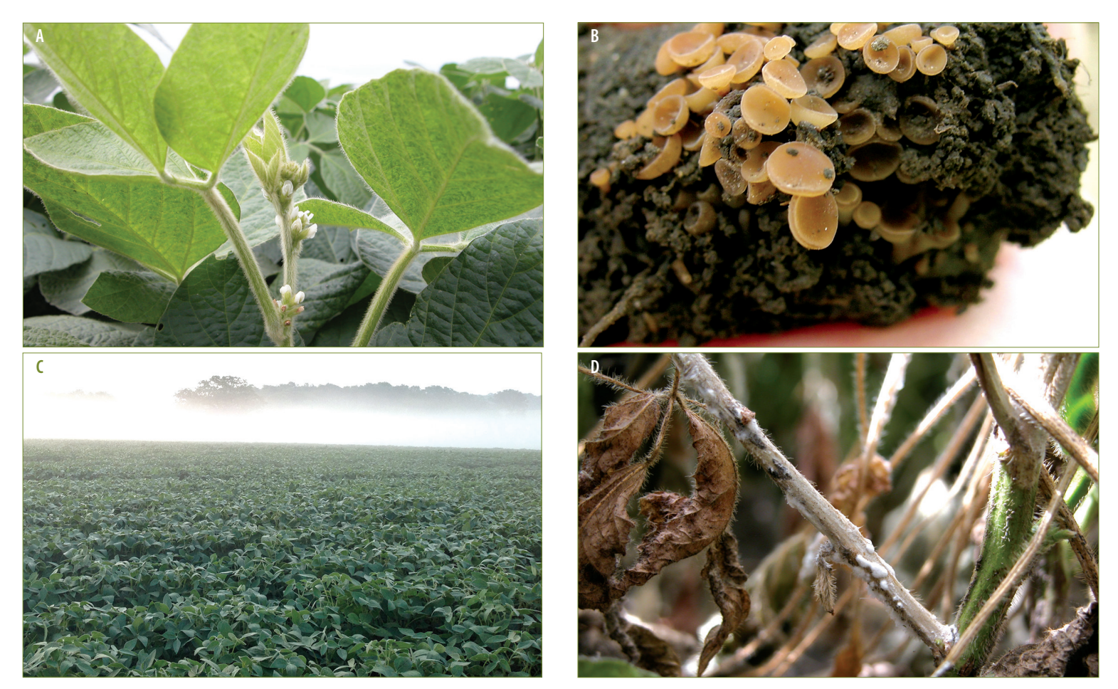
Figure 5. The three components required for white mold to occur are: (A) susceptible soybean varieties that are flowering; (B) apothecia, which produce Sclerotinia sclerotiorum spores; and (C) a cool, wet environment, especially within the soybean canopy. When all occur at the same time, white mold (D) can develop.

For white mold to develop, there must be a presence of the white mold fungus in a field, an environment favorable for apothecial development, ascospore infection and disease development, and a susceptible soybean variety, all occurring at the same time (Figure 5). Early canopy closure creates conditions favorable for disease. Factors that promote early canopy closure and