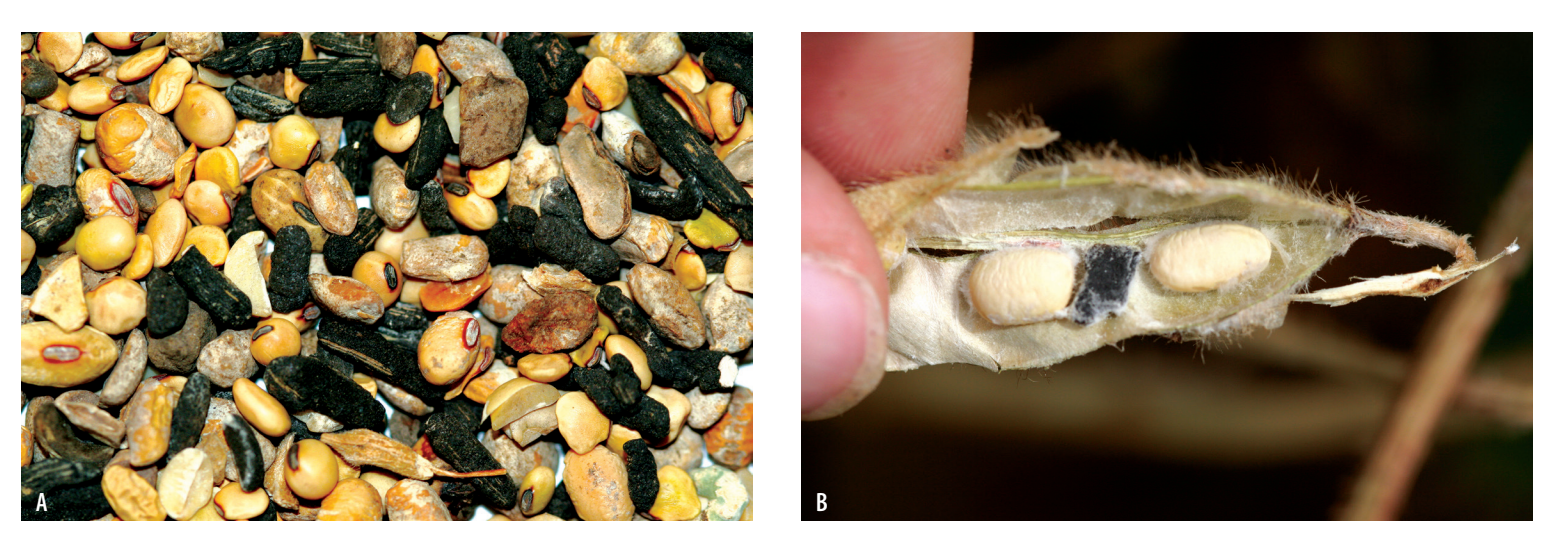
Figure 6. (A) Sclerotia of Sclerotinia sclerotiorum in harvested grain, and (B) an infected pod with sclerotium among the seed.

Taking accurate notes about where and how much white mold occurs in each soybean field is important for future disease management planning. Sclerotia can survive for as many as eight years in soil. Tracking disease levels across years also will help to determine the potential