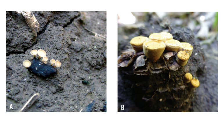
Figure 2. (A) Apothecia of Sclerotinia sclerotiorum , and (B) bird's nest fungus, a saprophyte sometimes confused with S. sclerotiorum apothecia. However, bird's nest fungus and other fungi that resemble apothecia do not grow from sclerotia.