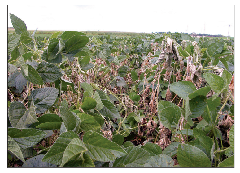
Figure 3. Symptoms of white mold include wilting, lodging, and plant death.

Severe infection weakens the plant and can result in wilting, lodging, and plant death (Figure 3). White mold often occurs in patches in the field. Signs of the fungus that can assist in diagnosis include white cottony mycelia (moldy growth) and sclerotia (Figure 4) on infected plant tissues. Sclerotia may be produced inside or outside of stems and pods. These signs of S. sclerotiorum and symptoms of white mold distinguish it from most other soybean diseases.