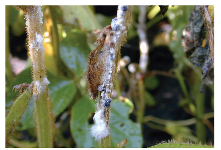
Figure 1. White mold on soybean.

Symptoms of white mold include water-soaked stem lesions that rapidly progress above and below infected nodes and eventually encircle the stem. Over time, infected stems become bleached and stringy. Lesions can also occur on stems, pods, petioles, and, in rare cases on leaves.