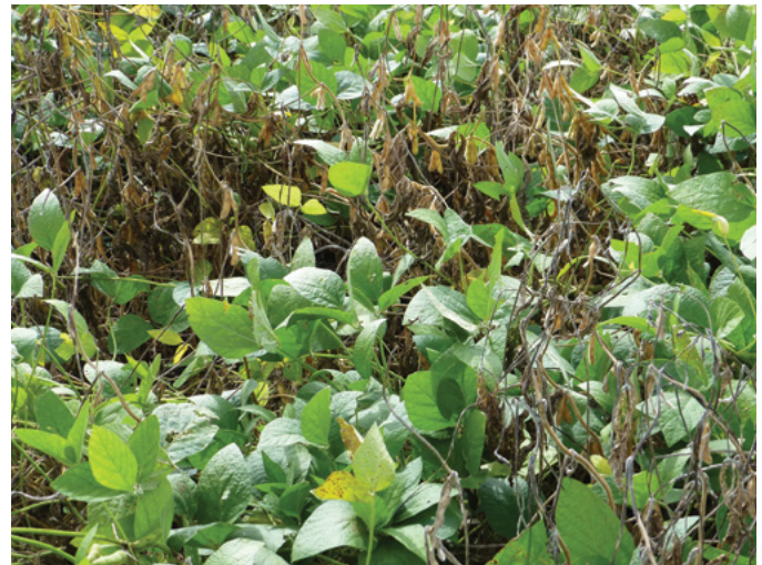
Figure 3. White mold can dramatically reduce soybean yield when severe. For every 10 percent increase in DIX after 65 percent, there was a corresponding yield loss of 10 bushels per acre.

In these studies, pesticide application timing significantly affected disease reduction and yield benefits. Two applications during flowering provided the most control and greatest yield benefits (Table 5). Single applications at beginning flower (R1) and full flower (R2) resulted in higher disease control than applications at beginning pod. Applications outside these flowering periods provided the lowest white mold control and yield benefits.