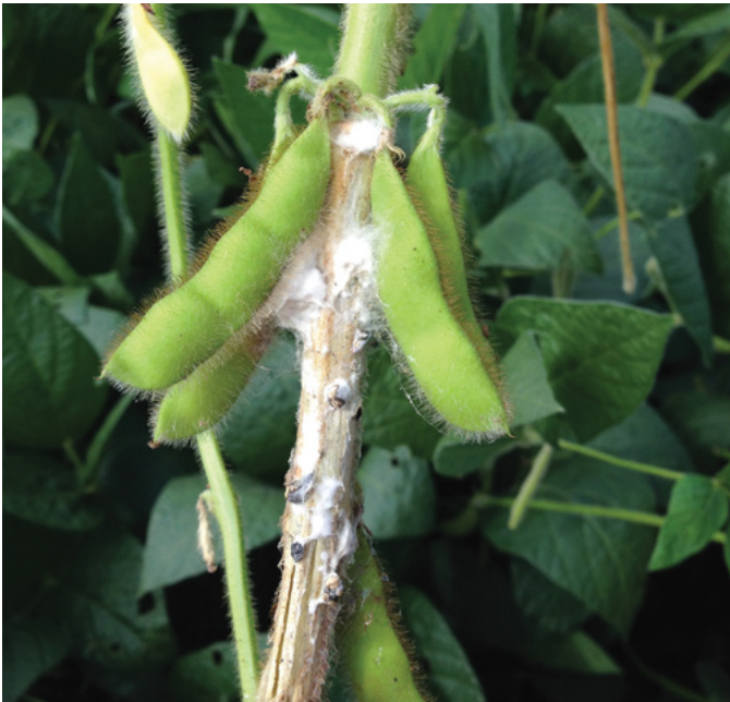
Figure 1. Characteristic white mold symptoms and signs include white, fluffy fungal growth on stems; hard, black sclerotia embedded in infected plant tissue; and bleached stems.