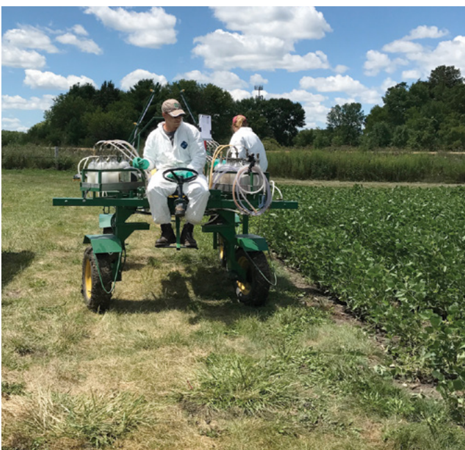
Figure 2. This study used more than 2,000 research plot-level data points across the North Central United States. One application method was using spray rigs capable of applying multiple treatments to research plots.