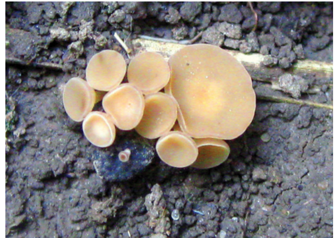
Figure 4. Apothecia germinate from sclerotia and release spores that infect soybean flowers, which makes certain chemical applications during soybean flowering the most effective treatments.

This analysis does not incorporate the benefits of resistance management and rotating modes of action across fields and seasons. All treatments generate positive benefits when disease severity and crop value are sufficiently high. For that reason, they can be part of an economical resistance management program.