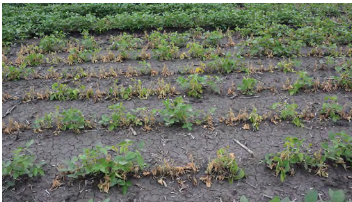
Phytophthora root rot usually occurs in patches in low-lying areas of field.