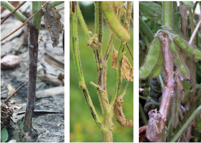
Phytophthora root and stem rot: Brown lesions extend from root.

Phytophthora root and stem rot is a common soilborne disease caused by a water mold, Phytophthora sojae . In poorly drained soils, Phytophthora can have a severe economic impact. The most common symptom is areas of the field with no stand from early season damping off and on older plants, a dark brown lesion on the lower stem that extends from the root into the upper portions of the plant. During the early stages of soybean development, when pre- and post-emergence damping off occur, symptoms are indistinguishable from Pythium , another water mold. Later in the growing season, symptoms on more mature plants include chlorosis of leaves and wilting, stunting, and death. Mid- to late season symptoms may be confused with Diaporthe stem canker or white mold.