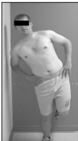
Fig. 5. Frontal plane evaluation.

Alteration of knee flexion has also been associated with increased stresses in the arm. Tennis players who did not have adequate bend in the knees, breaking the kinetic chain and decreasing the contribution by the hip and trunk, had 23–27% increased loads in horizontal adduction and rotation at the shoulder and valgus load at the elbow. [37] A mathematical analysis of the tennis serve showed that a decrease in 20% of the kinetic energy developed by the trunk resulted in a requirement of 34% more arm velocity or 80% more shoulder mass to deliver the same energy to the ball. [23]