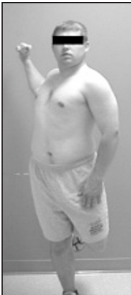
Fig. 10. Diagonal trunk rotation: maximal external rotation.

In order to create a stable base, the rehabilitation protocols start with the primary stabilising musculature such as the transverse abdominus, multifidus, and the quadratus lumborum. Due to their direct attachment to the spine and pelvis, they are responsible for the most central portion of the core stability. Exercises include the horizontal side support (figure 7) and isometric trunk rotation (figure 8). This stage