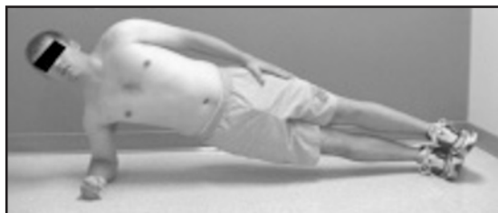
Fig. 7. Horizontal side support exercises.

partial quarter to half squats with no other verbal cues. Similar deviations in the quality of the movement are assessed as in the standing balance test. A Trendelenburg posture, which may not be noted on standing balance, may be brought out with a single-leg squat. The patient may use their arms for balance or may go into an exaggerated flexed or rotated posture ('corkscrewing') in order to put the gluteal or short rotator muscles on greater tension to compensate for other muscular weakness (figure 3).