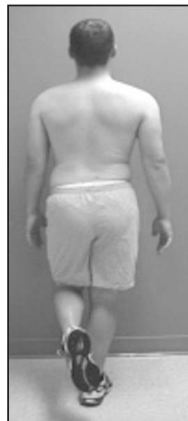
Fig. 2. Trendelenburg position, with the contralateral hip dropped.

As a result of the activations and interactive moments, there is a proximal to distal development of force and motion, according to the ‘summation of speed’ principle [2] that includes core activation. This is not always a purely linear development strictly from one segment to the next. In the tennis serve,