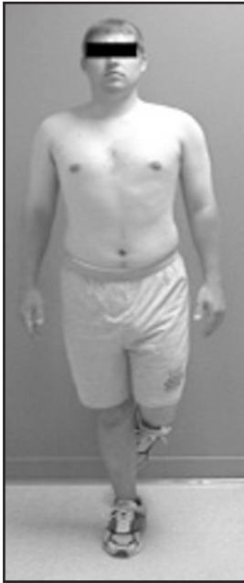
Fig. 1. One-leg stance. No verbal cues are given. Attention should be paid to alterations in posture or arm position.

on the contralateral side, that creates rotation as well as force generation. [16,24,26]