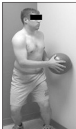
Fig. 8. Isometric trunk rotation.

The early focus is on the deficiencies discovered during the pre-rehabilitation examination. These usually include both altered patterns of motion of the hip, trunk and shoulder, and actual weakness or inflexibilities of muscles, and may be seen locally or distantly. Specific inflexibilities and weaknesses may be addressed locally by specific exercises, but motion patterns should be addressed on a global level involving the entire kinetic chain motion. Re-