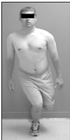
Fig. 3. 'Corkscrewing' – using hip rotators to stabilise the trunk over the planted leg in the presence of hip abductor weakness.

elbow maximal velocity is developed before maximal shoulder velocity. However, this general pattern of force development from the ground through the core to the distal segment has been demonstrated in the tennis serve, [23,31] baseball throw [26] and kick. [2]