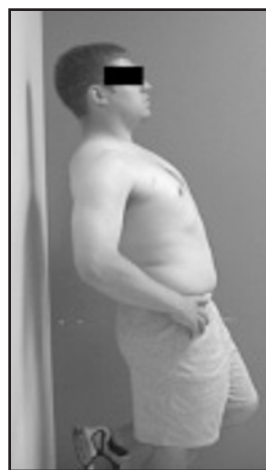
Fig. 4. Sagittal plane evaluation. The shoulders should barely touch the wall.

Weak hip muscles and resulting alteration of hip/trunk position are a common finding associated with knee injury. Weak hip abductors and tight hip flexors are seen in association with anterior knee pain and chondromalacia. [33,34] Alterations in hip muscle activity are associated with increased hip varus and hip flexion positioning and increased knee valgus positioning in squatting or landing manoeuvres, all of which increase load on the anterior cruciate ligament. A recent longitudinal study looked at core stability parameters and found that weakness in hip external rotation was correlated with incidence of knee injury. [35] Based on these associations, most rehabilitation and conditioning programmes for the knee now emphasise core stabilisation and hip strengthening. [33,34,36]