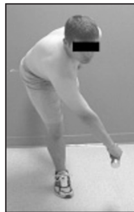
Fig. 11. Diagonal trunk rotation: cross body motion

Core stabilisation should avoid emphasising the use of single planar exercises that isolate specific muscles or specific joints. They may be used at times during the rehabilitation protocol, but emphasis should be on early progression to functional