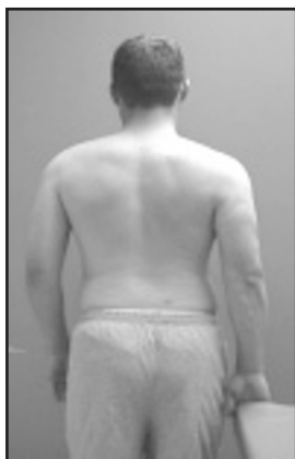
Fig. 12. The low row exercise-integrated trunk extension/scapular retraction/arm extension. It may be started isometrically and then progressed to isotonic motion.

Core stability is a pivotal component in normal athletic activities. It is best understood as a highly integrated activation of multiple segments that provides force generation, proximal stability for distal mobility, and generates interactive moments. It is difficult to accurately quantify by isolating individual components, but its function or dysfunction can