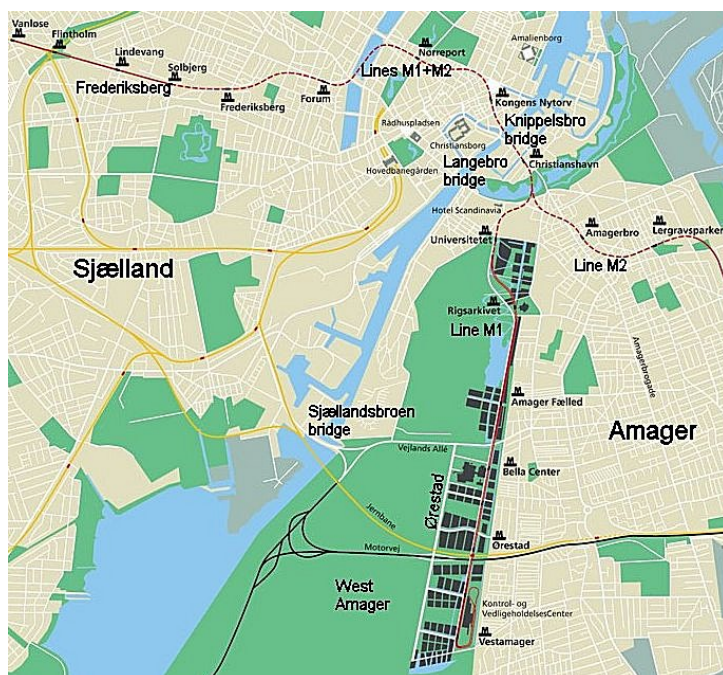
Figure 1. Alignment of the M1 and M2 metro lines

The alignment of the M1 metro line in west Amager largely corresponds to the 1961 plan. The new town Ørestad will expand over the next 20 years to an area of 310 hectare, providing 60,000 jobs, 20,000 education places and 20,000 dwellings. Some larger companies have built new offices in Ørestad: Telia, Copenhagen Energy, Keops and Ferring. The Danish Broadcasting Corporation transferred all its activities to a new television centre in Ørestad in 2005. The University of Copenhagen has been enlarged in the area, and the construction of an IT University is finalised.