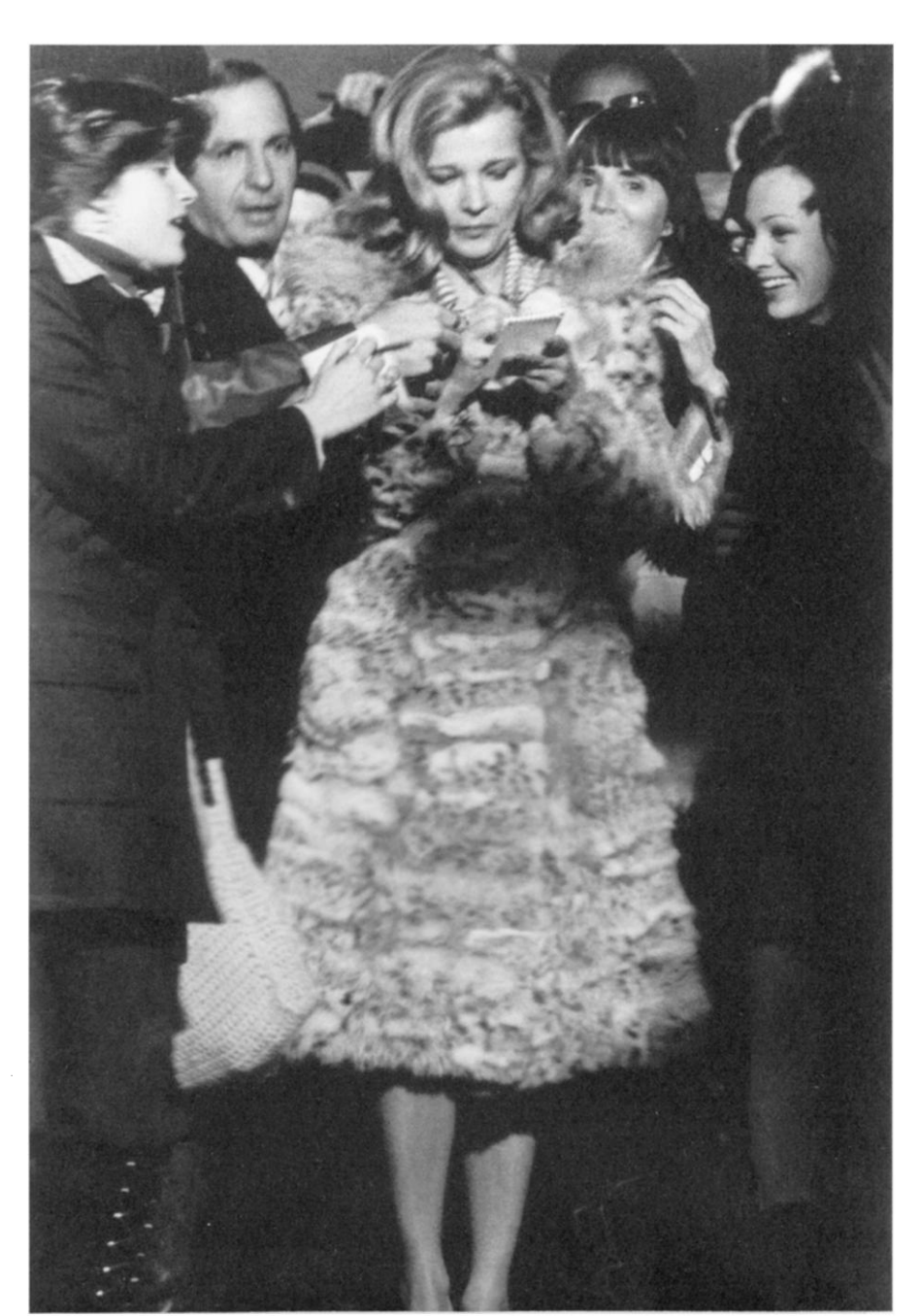
Real life is another performance: Gena Rowlands as Myrtle in Opening Night.