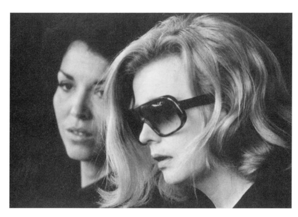
Zohra Lampert and Gena Rowlands in Opening Night

Opening Night makes real life and art seem like the same thing.