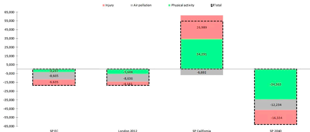
Fig. 2. Changes in DALYs for each scenario, broken down into the proportions attributable to changes from air quality, physical activity and road injuries. Detailed results in Table S2.

An important shift in the disease burden was observed for cardiovascular diseases – particularly ischemic heart disease – and type II diabetes both for men and women (Table 3). For instance, by assuming the travel pattern of SP California, São Paulo would have about 800 extra deaths from reductions in physical activity, of which nearly 700 would be from cardiovascular diseases. The changes in the disease burden favoured women in all scenarios, except for SP EC scenario, mostly due to lower baseline non-travel physical activity levels. In SP