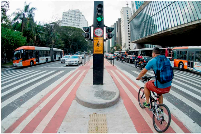
Fig. 3. Cycle lane at the Paulista Avenue, São Paulo, built in 2015. Note motorcyclists trafficking between car queues, a common feature in São Paulo, and the dedicated bus lanes next to the sidewalks. Left, the remaining original vegetation that once were in the Paulista Avenue (Trianon Park); Right, the Museum of Arts of São Paulo (MASP).

outcome associations were not included, such as vehicle speeds, which could affect air pollution due to an association between speed and congestion as well as the number and severity of traffic injuries (Elvik, 2013); traffic noise; and other forms of interpersonal violence related to travel behaviour (e.g., female sexual harassment and road rage episodes). We also did not model changes in vehicle emission factors, particularly cleaner buses for public transport, which if implemented would produce substantial health benefits.