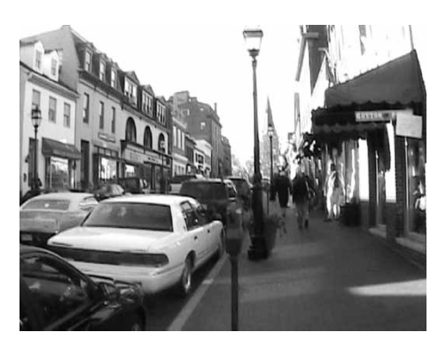
Figure 2. Scene rated high on all eight urban design qualities (Annapolis, MD).

Figures 2-5 are static images from four of the video clips, illustrating variation in urban design qualities. Clips were rated by the expert panel on a scale that represented low to high levels of each quality (1 to 5).