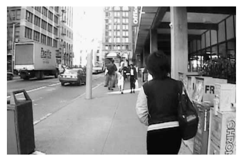
Figure 4. Scene rated high on enclosure, linkage, and complexity (San Francisco, CA).