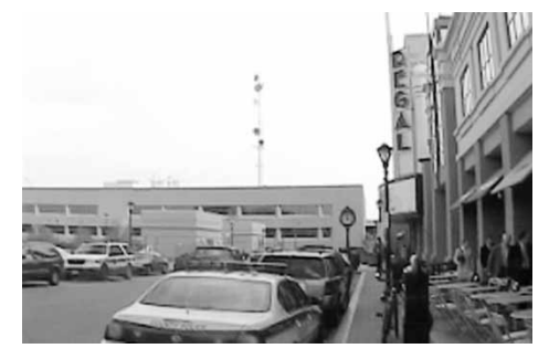
Figure 5. Scene rated low on all eight urban design qualities (Rockville, MD).