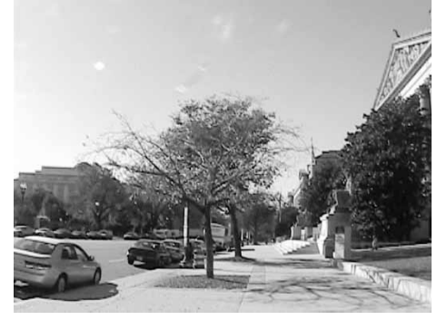
Figure 3. Scene rated high on imageability, legibility and coherence (Washington, DC).