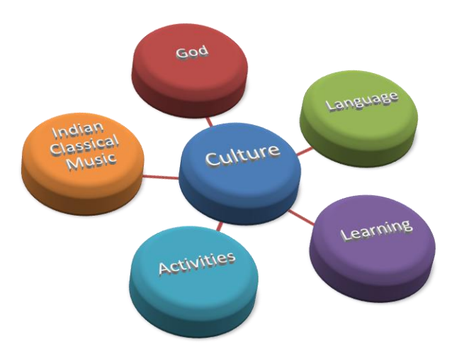
Figure 5: Cluster 1

(Corbin & Strauss, 2008). The following clusters resulted from the colour-coding of texts written by Tyagaraja (see figures 5 and 6 below).