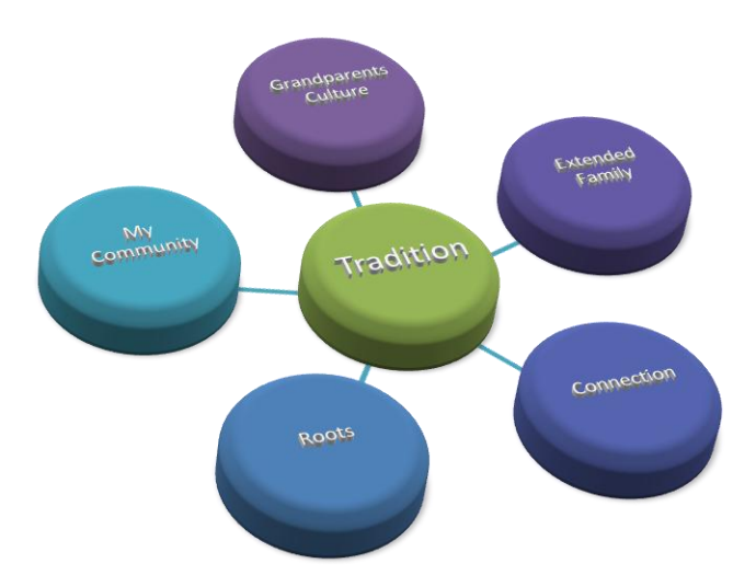
Figure 6: Cluster 2

Next, themes that emerged after analyzing the narratives were recorded. Both deductive and inductive analysis was used. Using inductive analysis, the researcher gathered data, looked for a pattern, and then developed a system (Corbin & Strauss, 2008). With deductive analysis, the data was analyzed using a hypothesis. Here, the researcher had to affirm the presence of the theory or not in the data (Chambliss & Schutt, 2006).