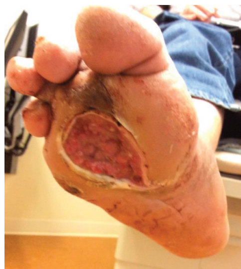
Figure 5. RIGHT MID-PLANTAR DIABETIC FOOT ULCER

grand mal seizures following HBOT range from 1 to 4 cases in 10,000 patient treatments. 2