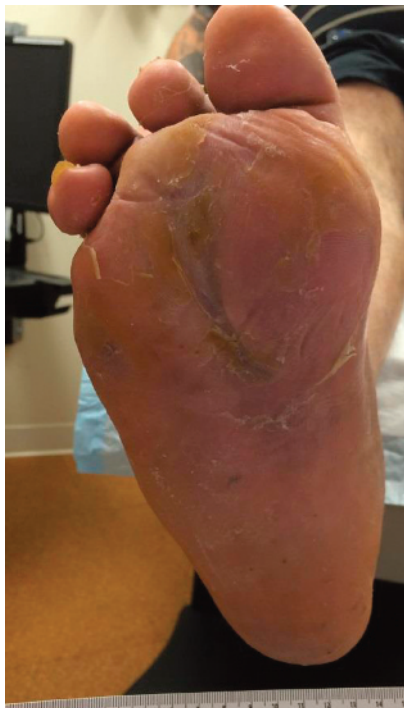
Figure 6. HEALED RIGHT MID-PLANTAR DIABETIC FOOT ULCER

forbidden in the chamber is provided to them. Examples include newspaper, hairspray, nail polish, cell phones, hand warmers, heating pads, and perfume. Items that may cause sparks or damage the acrylic tube of monoplace chambers are also prohibited. Examples include keys, coins, jewelry, and toys.