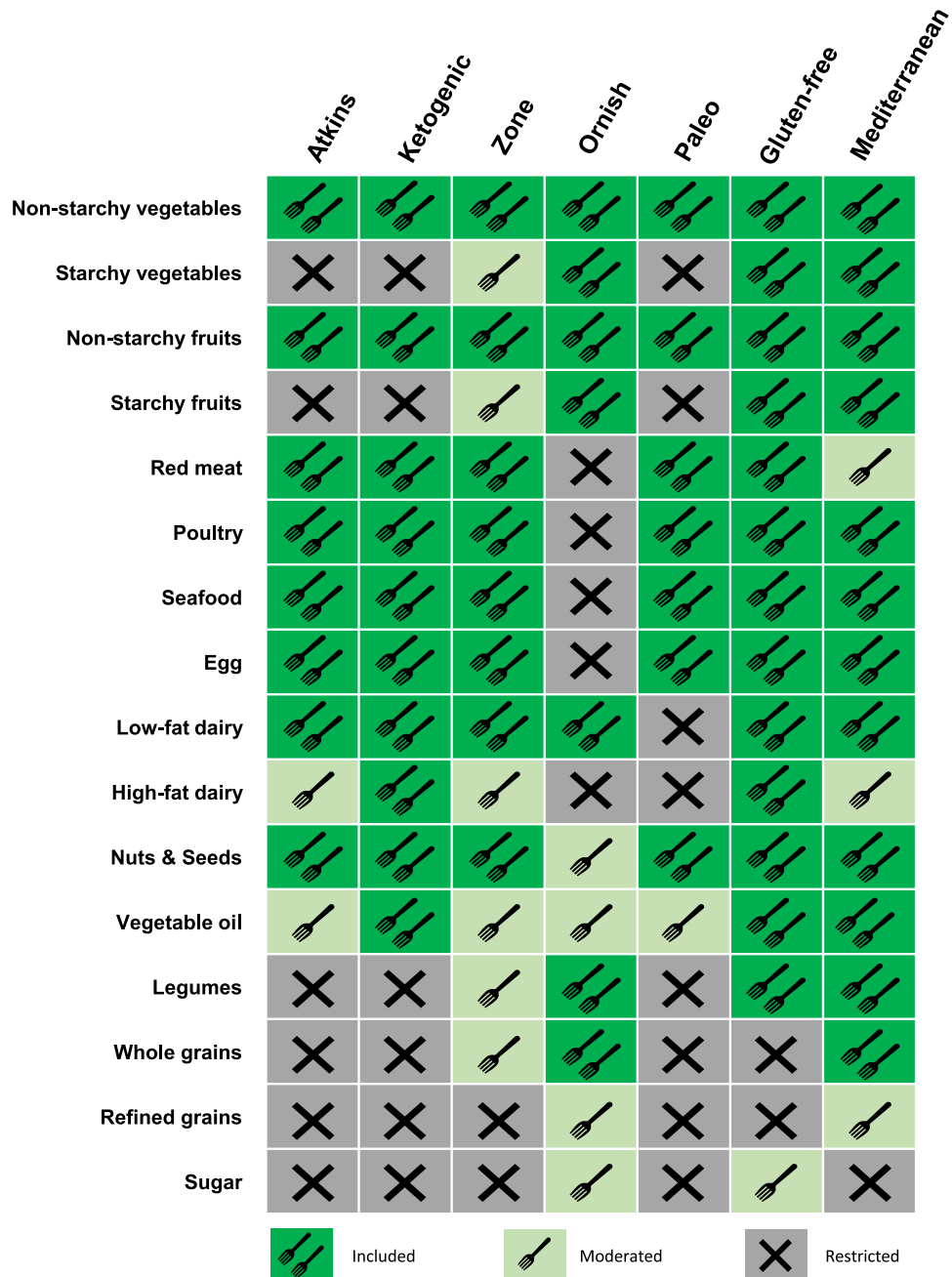
Fig. 1. Food groups included or excluded in popular diets: Atkins, Ketogenic, Zone, Ornish, Paleo, gluten-free, and Mediterranean.