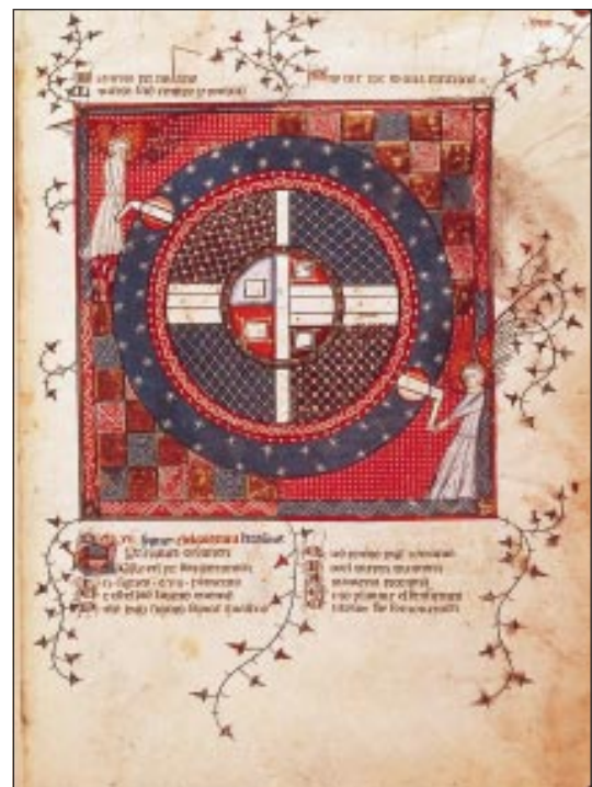
Angels make the universe turn—and time moves on

Of 3393 patients with a bloodstream infection, 1691 patients were randomised to the intervention group and 1702 to the control group. No patients were lost to