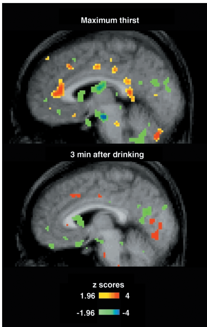
FIGURE 3. Pseudocolor images of positron emission tomography of subjects made thirsty by an intravenous infusion of hypertonic saline ( top ) and then 3 min after thirst had been satiated by the drinking of water ( bottom ). Sagittal images of the left side of the brain 8 mm lateral to the midline show activations (yellow and red regions) proceeding along the cingulate cortex from anterior to posterior parts in the thirsty subjects that were extinguished on slaking the thirst. Reproduced with permission from Ref. 4.

of the status of extracellular fluids entails both hormonal and visceral afferent pathways.