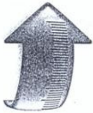
Gráfico de Crescimento