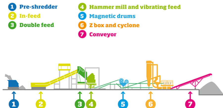
Fig. 1. Shredding plant layout of case study site.

A review was conducted of the thermal-processing plants available globally. Initially, all companies were included which had the potential to provide either biomass or waste thermal plants. These companies were subsequently evaluated to determine their potential suitability for use as an ASR thermal process technology provider. Initial screening of more than one hundred identified companies was carried out. This focused on the maturity of their