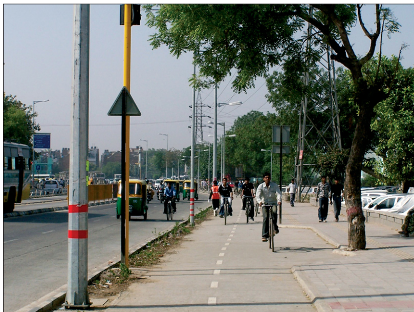
Figure 2: New bicycle facilities in Delhi, India

We showed the potential effect on the population distribution of body-mass index by modelling the effect of