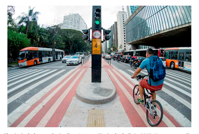
Fig. 3. Cycle lane at the Paulista Avenue, São Paulo, built in 2015. Note motorcyclists trafficking between car queues, a common feature in São Paulo, and the dedicated bus lanes next to the sidewalks. Left, the remaining original vegetation that once were in the Paulista Avenue (Trianon Park); Right, the Museum of Arts of São Paulo (MASP).

outcome associations were not included, such as vehicle speeds, which could affect air pollution due to an association between speed and congestion as well as the number and severity of traffic injuries (Elvik, 2013); traffic noise; and other forms of interpersonal violence related to travel behaviour (e.g., female sexual harassment and road rage episodes). We also did not model changes in vehicle emission factors, particularly cleaner buses for public transport, which if implemented would produce substantial health benefits.