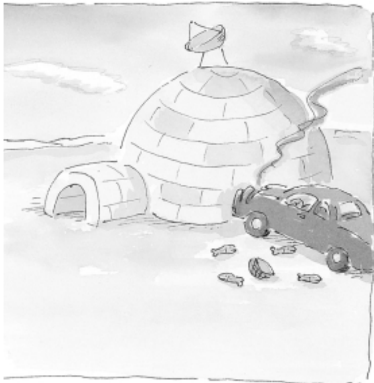
customer transactions are hassle-free.

Companies that pursue the same value discipline have remarkable similarities, regardless of their industry. The business systems at Federal Express, American Airlines, and Wal-Mart, for example, are strikingly similar because they all pursue opera-