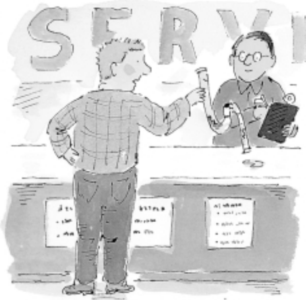
Customer intimacy means customers get...

In its move toward customer intimacy, Kraft USA has created the capacity to tailor its advertising, merchandising, and operations in a single store or in several stores within a supermarket chain to the needs of those stores' particular customers. Kraft has the information systems, analytical capability, and educated sales force to allow it to develop as many different so-called micro-merchandising programs for a chain that carries its products as the chain has stores. The program can be different for every neighborhood outlet. But to accomplish this, Kraft had to change itself first. It had to create the organization, build the information systems, and educate and motivate the people required to