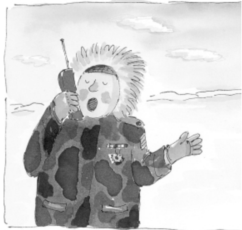
Operational excellence means

By operational excellence, we mean providing customers with reliable products or services at competitive prices and delivered with minimal difficulty or inconvenience. Dell, for instance, is a master of operational excellence. Customer intimacy, the second value discipline, means segmenting and targeting markets precisely and then tailoring offerings to match exactly the demands of those niches. Companies that excel in customer intimacy combine detailed customer knowledge with operational flexibility so they can respond quickly to almost any need, from customizing a product to fulfilling special requests. As a consequence, these