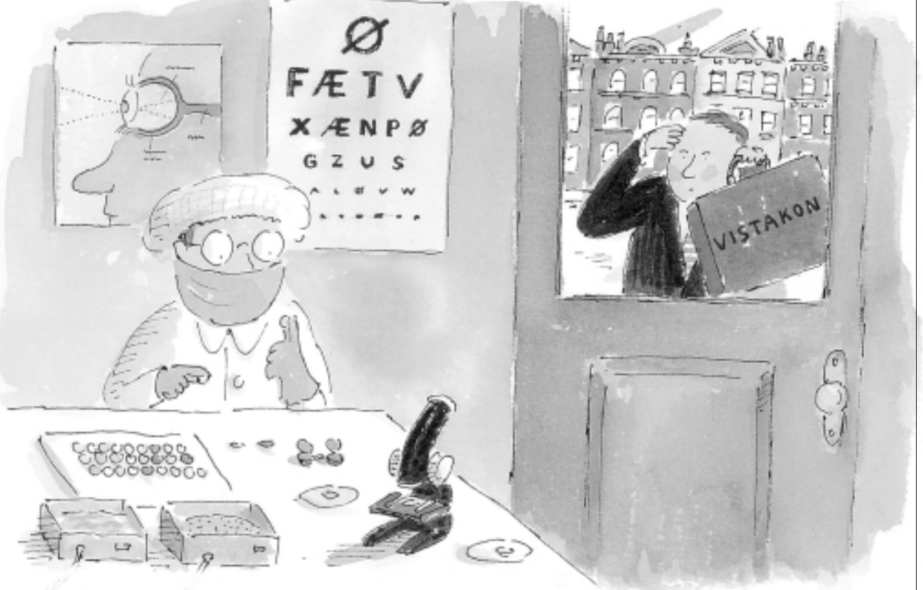
Product leaders are open to new ideas wherever they can find them.

Becoming an industry leader requires a company to choose a value discipline that takes into account its capabilities and culture as well as competitors' strengths. (For more on choosing a value discipline, see the insert "Choosing Disciplines or Choosing Customers?") But the greater challenge is to sustain that focus, to drive that strategy relentlessly through the organization, to develop the internal