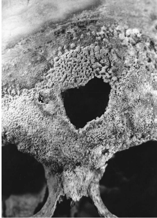
Figure 1 Localized destruction of skull due to acid-like substance.

Confronted with the evidence, the defense argued that perhaps the alterations had been produced within the cistern, with the skull in contact with caustic substances within the soil.