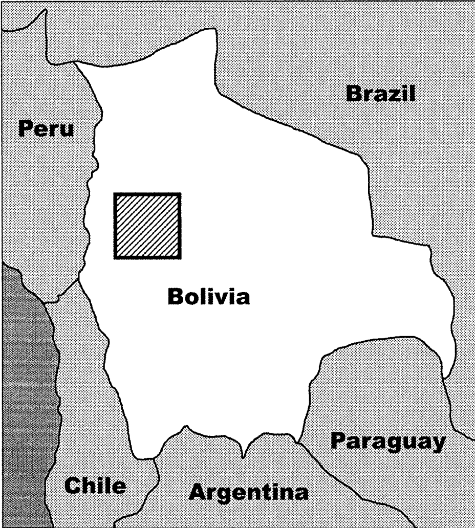
Map I: Bolivia: