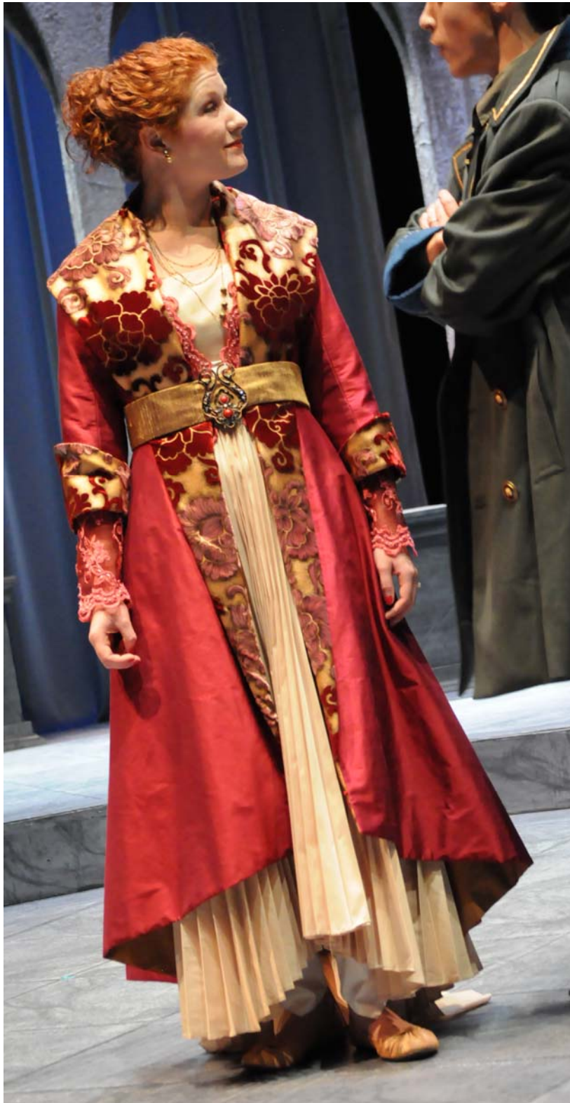
Desdemona's Overcoat: Performance Appearance