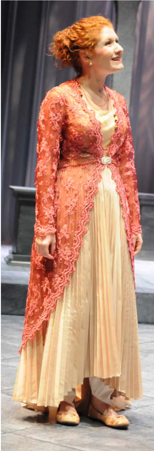
Desdemona Lace Overlay: Performance Appearance