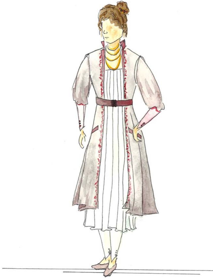
EMILIA OTHELLO - WILLIAM SHAKESPEARE ACT II, SCENE I cmj 2012