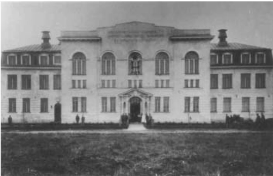
Figure 2. Main building of V.M. Bekhterev Psychoneurological Research Institute, Bekhterev Street 3, St. Petersburg.

autobiography he explained his choice by the fact that it gave him an opportunity to be closer to social life (Bekhterev, 1928). As a last-year student, Bekhterev took part in the 1877–1878 Russian-Turkish war in the “Ryzhov brothers shifting sanitary group.” The whole group consisting of 12 persons included 8 students of the Medical Surgical Academy.