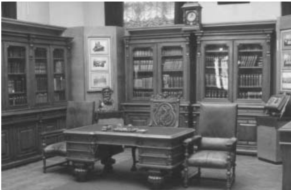
Figure 3. V.M. Bekhterev Memorial Museum.

Under the pseudonym of “Sanitarian,” Bekhterev sent his reports to the Severny Vestnik ( Northern Herald ) (Bekhterev, 1877). In 1878, ahead of schedule, he successfully passed his final examinations and stayed to continue his training at the Professor Institute of the Academy.