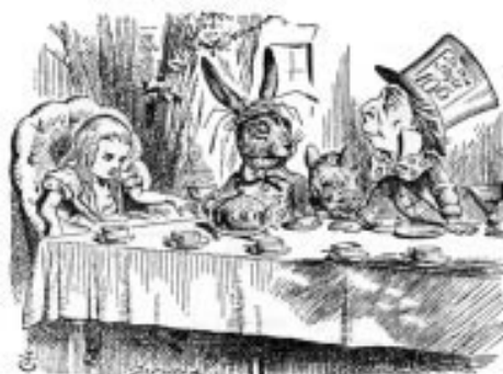
A dysfunctional group: a dominant character may make it difficult for other students to be heard