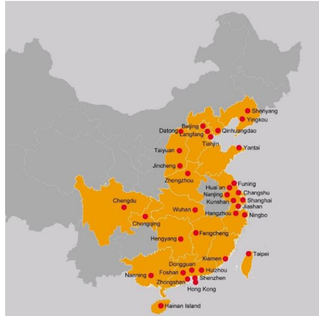
Figure 3. Foxconn locations in greater China.

Foxconn not only has factory complexes in Shenzhen and all four major Chinese municipalities of Beijing, Shanghai, Tianjin and Chongqing, but also in 15 provinces throughout the country (Figure 3). Foxconn Taiyuan in north China's Shanxi province, with 80,000 workers, specialises in metal processing and assembly. It manufactures iPhone casings and other components in the upstream supply chain and sends the semi-finished products to a larger Foxconn Zhengzhou complex in adjacent Henan province for final assembly. In 2012, the subtle shift in production requirements from iPhone 4S to iPhone 5 and the speedup to meet Apple's delivery time placed Foxconn and its workers under intense pressure. However, this tightly integrated production regime simultaneously provided workers with leverage, enabling them to demonstrate their collective strength in the fight for their own interests.