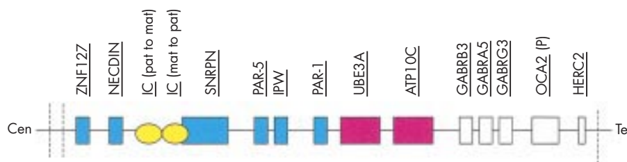
Figure 4 The Angelman/Prader-Willi region on chromosome 15q11-13 which spans 4 Mb. The common breakpoints are represented by dashed lines. Paternally imprinted genes are depicted in blue and maternally imprinted genes in pink. Those depicted in white are not known to be imprinted. The imprinting centre (IC) is bipartite. The centromeric portion is responsible for the paternal to maternal imprint switch and deletions in this part cause AS. For further details see text.