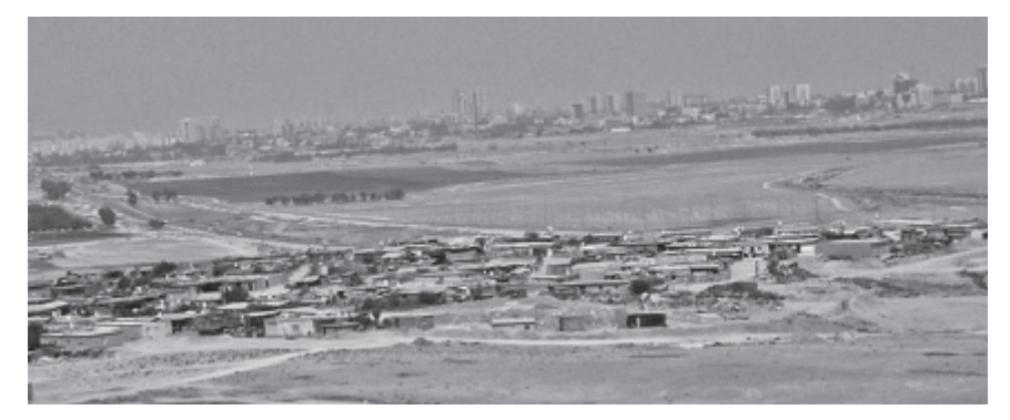
FIGURE 10.3 Chashem Zaneh, an unrecognized Bedouin locality with the city of Beersheba in the background, August 2008