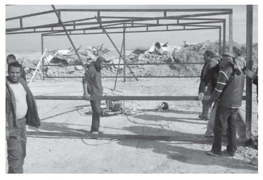
FIGURE 10.2 Rebuilding the mosque, Wadi al-Na'am, January 2009