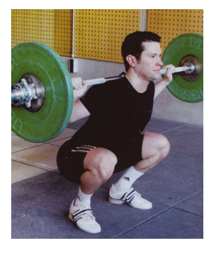
Fig. 6 Deep back squat (high bar)

mechanical loading tendon', 'in vitro mechanical loading ligament', 'in vitro patellar tendon properties', 'in vitro cruciate ligament properties', 'hip endoprosthesis pressure', 'gender differences cartilage volume knee'.