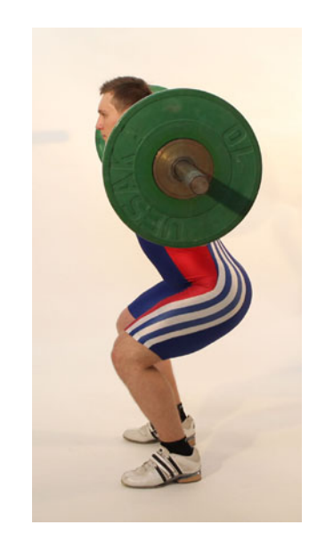
Fig. 3 Half back squat