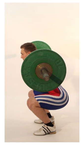
Fig. 2 Parallel back squat

On the basis of electromyographic studies, Escamilla [8] and Schoenfeld [9] suggest that squatting depths below 90° do not induce greater neural stimuli of the quadriceps, because the activity signals remained constant. Abandonment of deep squats minimizes the magnitude of tibio- and patellofemoral compressive stress as well. Compared with deep squats, the quarter and half squat necessitate higher weights to induce effectual training stimuli to the hip and leg extensors due to the advantage of higher strength-developing conditions at larger extension angles. With increasing loads, a linear rise of compression load of the vertebral bodies [10] and of the intradiscal pressure occurs [11]. Higher weights require a greater degree of torso stabilization to counteract impairing spinal-shear forces. Higher weights result in increased tibio- [12, 13] and patellofemoral compressive forces [14]. These relationships have been ignored in recent publications that have discussed spinal-[9] and knee-joint forces [8, 9] at different squatting depths. It is unclear if utilizing half or quarter squats places less stress on the various joints used within the squatting motion than deep squats. In this article a literature-based load analysis of different squatting variants on spinal- and knee-joint stress is presented to assess whether squats with less knee flexion (half/quarter squats) are safer on the musculoskeletal system than deep squats.