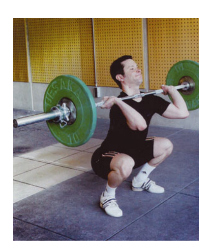
Fig. 5 Deep front squat