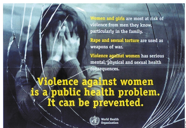
Figure 3: WHO poster highlighting mental effects of abuse

Analysis of the relations between partner abuse, health status, and use of medical care in women in population-based and clinical studies has shown poorer overall mental and physical health, more injuries, and more consumption of medical care including prescriptions and admissions to hospital in abused than non-abused women. 5-7,22 In a Canadian population-based study, 2 battered women sought care from accident and emergency departments and saw a medical professional about 3 times more often than non-battered women. Furthermore, strong evidence suggests that use of medical services increases with the severity of physical assault. 5 Several estimates have been made of the health-care costs of intimate partner violence, but only a few rigorous cost analyses have been done. In a well designed comparison of health plans, battered women generated around 92% more costs per year than non-battered women, with mental-health services accounting for most of the increased costs. 7