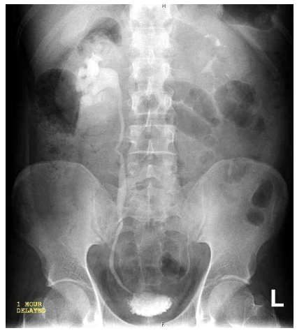
Fig 2 IVU, 1 h after contrast injection, showing a normal left kidney and dilated right pelvicalyceal system. The ureter is dilated all the way to the lower ureter (where a small calculus was visible on plain imaging). The image should be taken after micturition to allow the ureter to be traced to the bladder

Fig 1 Representative axial slices of the kidneys, ureter, and bladder for renal colic, using NCCT. (A) Normal contralateral (left) kidney, with hydronephrosis of the right kidney and peri-nephric fat stranding indicating obstruction. (B) Distal ureteric stone (4 mm in diameter) with peri-ureteric oedema (rim sign) differentiating it from a phlebolith; the dilated ureter could also be traced down to the stone