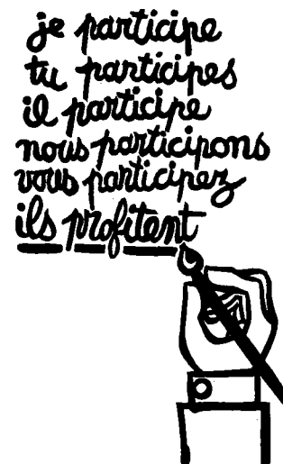
FIGURE 1 French Student Poster. In English, I participate; you participate; he participates; we participate; you participate . . . They profit.

There is a critical difference between going through the empty ritual of participation and having the real power needed to affect the outcome of the process. This difference is brilliantly capsulized in a poster painted last spring by the French students to explain the student-worker rebellion. 2 (See Figure 1.) The poster highlights the fundamental point that participation without redistribution of power is an empty and frustrating process for the powerless. It allows the power-holders to claim that all sides were considered, but makes it possible for only some of those sides to benefit. It maintains the status quo. Essentially, it is what has