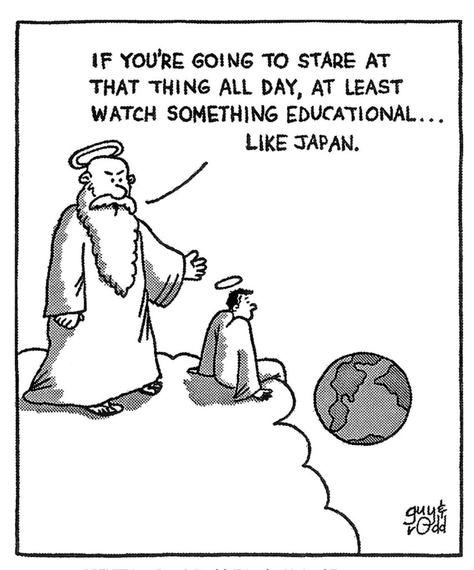
BREVITY: © Guy & Rodd /Dist. by United Feature